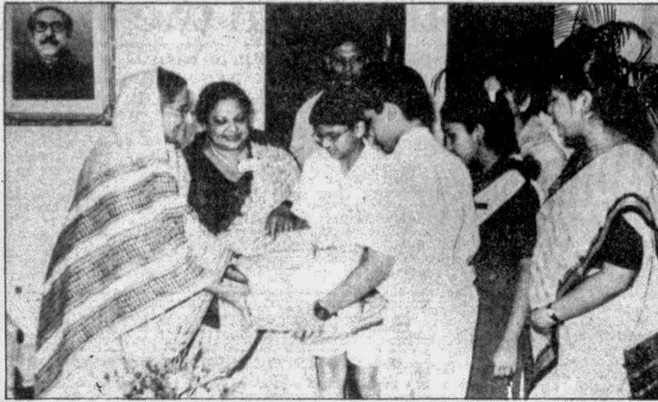
Prime Minister Sheikh Hasina receiving donations to the PM's Relief Fund from different organisations and individuals yesterday.

The Relief and Disaster Management Ministry yesterday sanctioned Tk five lakh and 800 metric tons of rice for six flood-stricken districts, reports UNB. According to an official handout, 300 metric tons of rice was sanctioned for Sirajganj, 200 metric tons for Chandpur, 100 metric tons for each of Habiganj and Tangail and 50 metric tons for each of Khagrachhari and Panchagarh districts. Besides, Tk two lakh was allocated for Chandpur, Tk one lakh for each of Habiganj and Tangail and Tk 50,000 for each of Khagrachhari and Panchagarh districts.