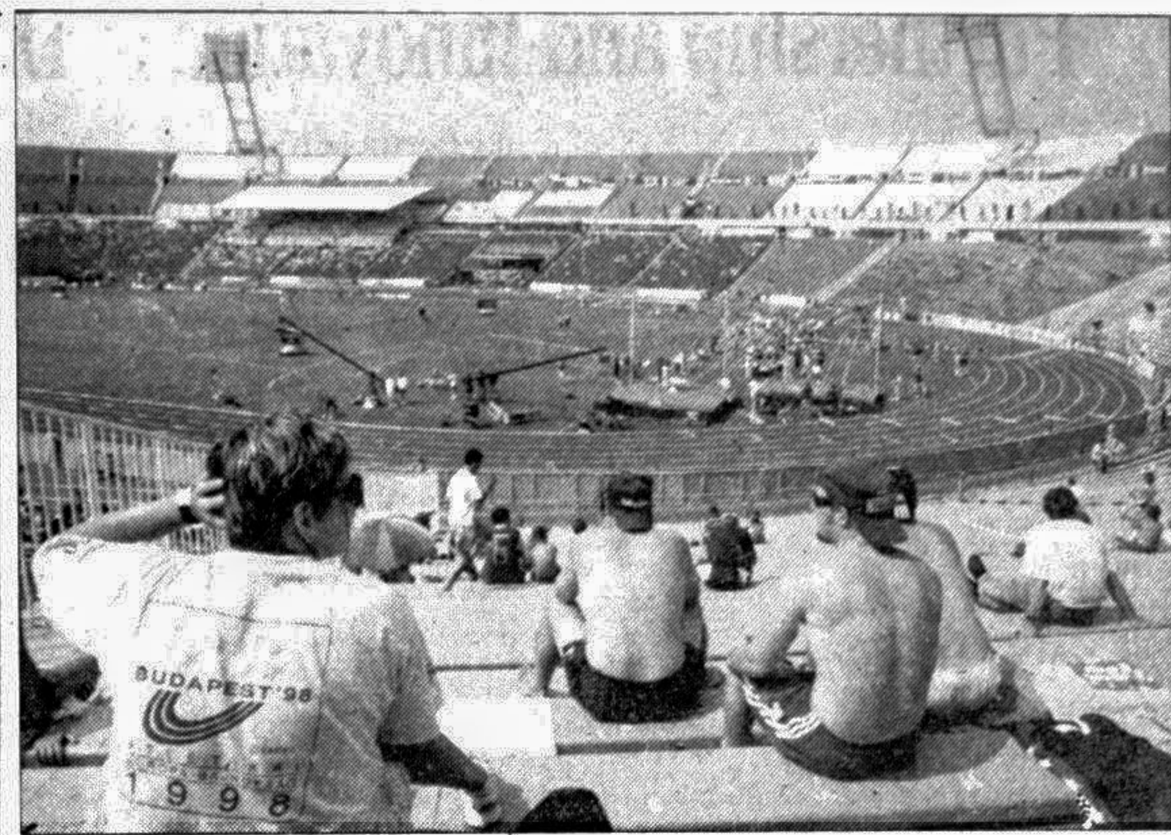
WHO CARES ABOUT ATHLETICS! An almost vacant Budapest stadium in Budapest hosting the 17th European Athletics Championships. The picture was taken yesterday.

Wladyslaw Komar, who won the shot put gold medal at Munich in 1972, and Tadeusz Slusarski, the pole vault gold medalist in Montreal in 1976, died when their vehicle collided head-on with another car late Monday in a rural area 550 kilometers (330 miles) northwest of Warsaw, said newspaper reports and the PAP state news agency.