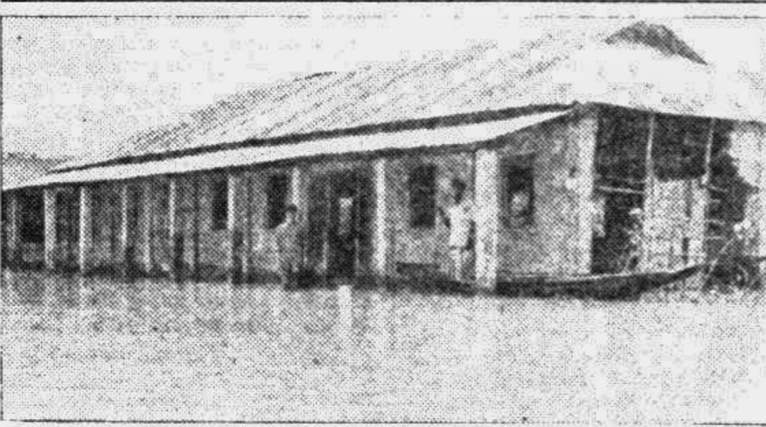
SYLHET: Flood water has submerged Habishaympur Government Primary School.

Adequate relief goods should be supplied among the flood-hit people to mitigate their sufferings. The authorities concerned should take immediate steps to repair disordered tube wells to solve drinking water crisis and to prevent water borne diseases.