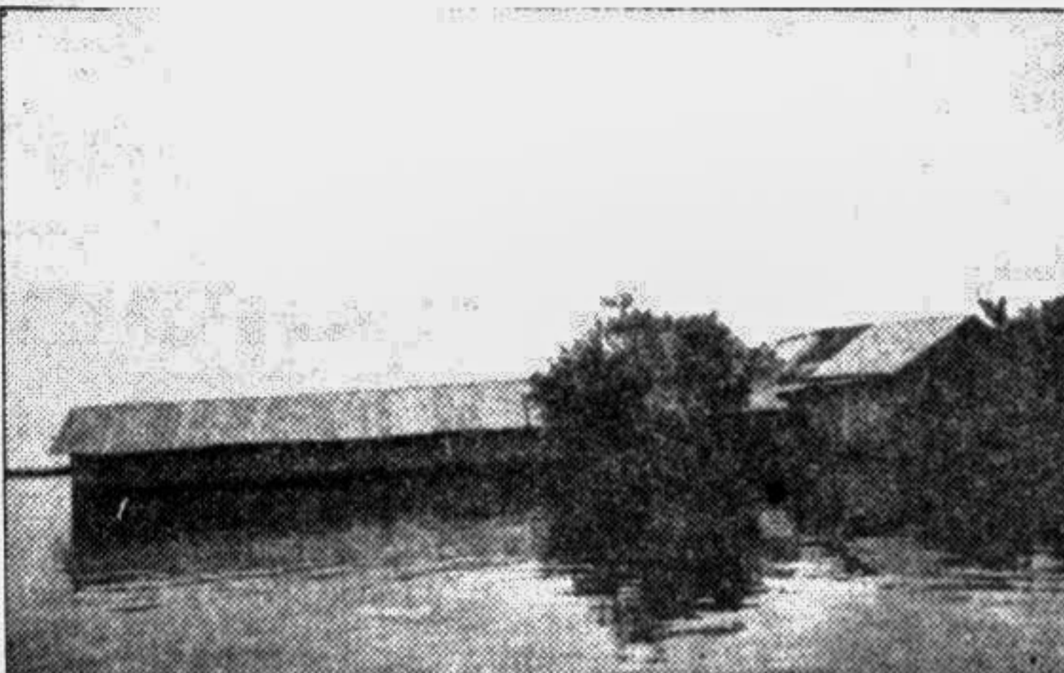
Terafia Primary School of Pailgaon union under Jagannathpur thana of Sunamganj district under flood water.