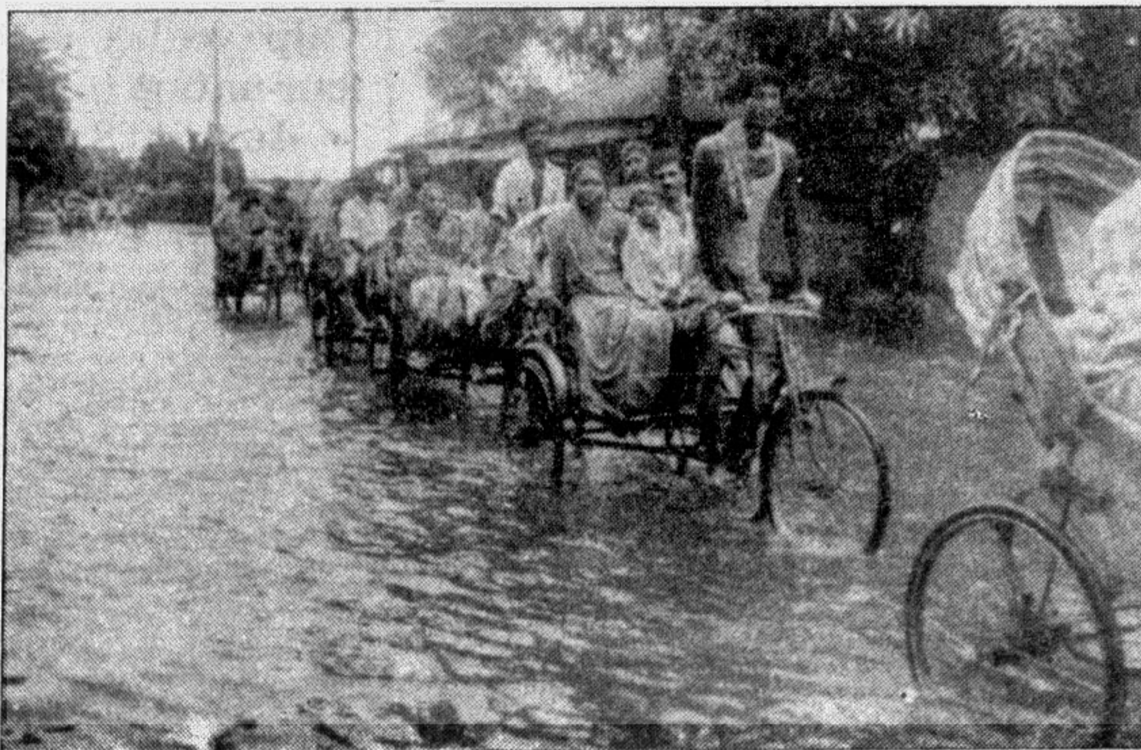
GAIBANDHA: Flood water overflowing the main road of the district town at Purbopara.

BARISAL, Aug 17: A total of 5,92,765 metric tonnes (MT) of Aus paddy are expected to be produced here in 11 southern districts under Barisal Agriculture Extension Zone (BAEZ) during the current season, reports BSS. The districts are: Barisal, Jhalakati, Bhola, Pirojpur, Patuakhali, Barguna, Faridpur, Madaripur, Gopalganj, Rajbari and Sahriampur. According to an official source, a total of 3,56,603 hectares were brought under Aus cultivation this year in this region. The target of cultivation was fixed at 3,37,200 hectares which was exceeded by 19,403 hectares.