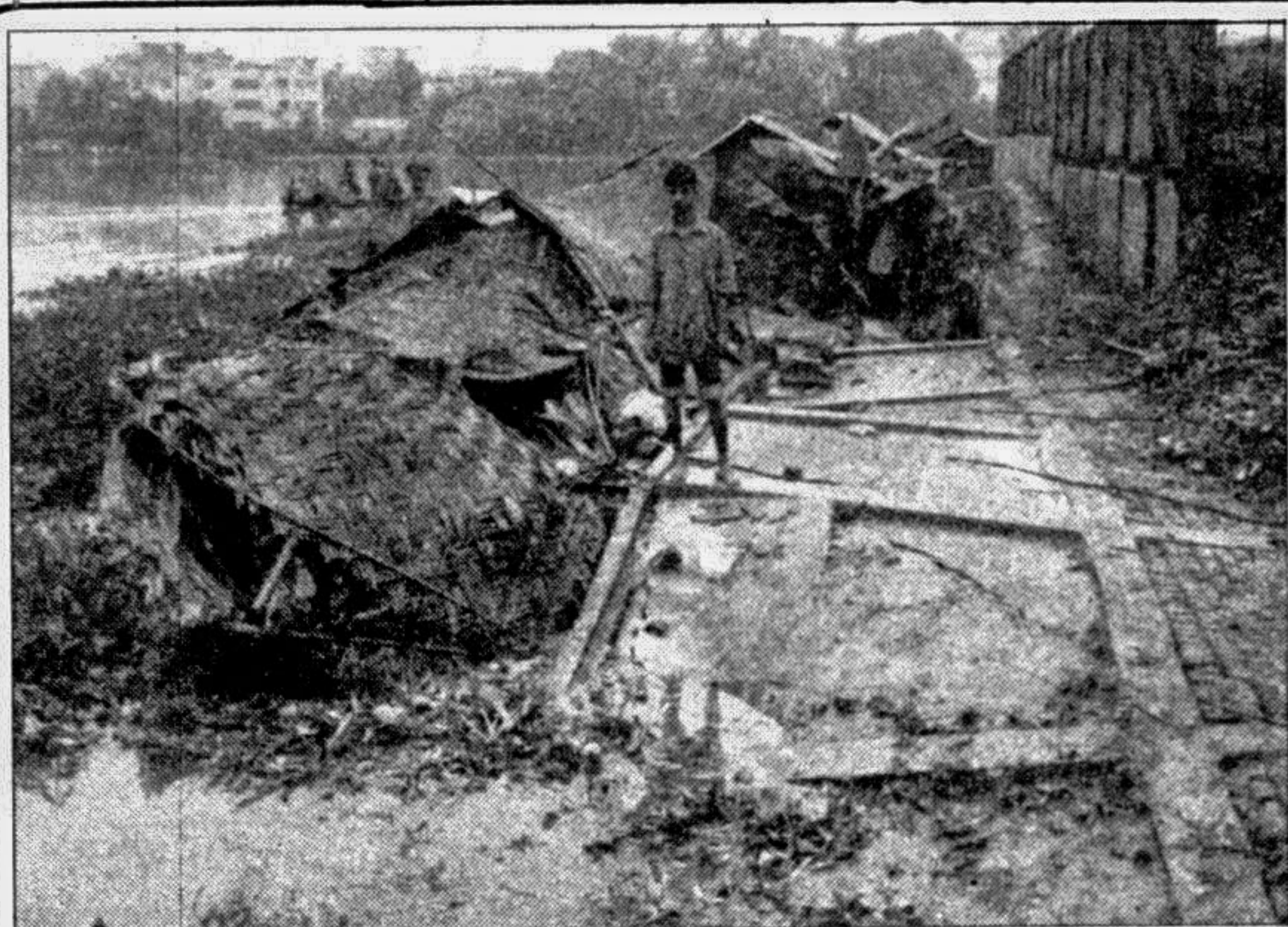
The collapsed boundary wall of the PDB sub-station at Mirpur in the city under which three persons were killed.

By Nurul Kabir Prime Minister Sheikh Hasina yesterday asked her cabinet colleagues to separately assess the damages caused by the flood so that the Ministry of Foreign Affairs can make a presentation before the donor community very soon. The PM gave the directive at a Cabinet meeting held yesterday evening. According to cabinet sources, Foreign Minister Abdus Samad Azad will brief the donor community sometime this week on the devastation caused by the flood. The Cabinet also approved a proposal for multipurpose use of Voters Identity Card. Once completed, the Voters ID cards would be used for as many as 14 purposes including distribution See Page 12 Col 4