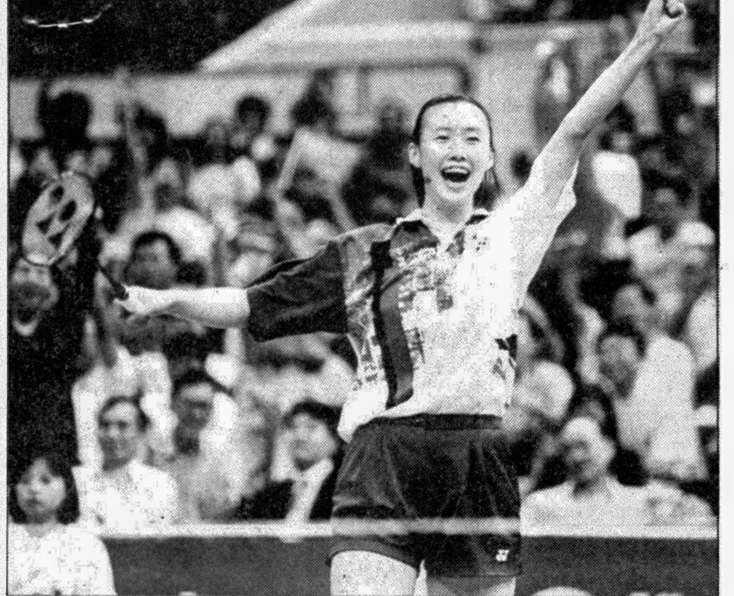
An ecstatic Ye Zhaoying of China celebrates her highly creditable win against Indonesia's Susi Susanti in the final of the 170,000 dollars Singapore Open yesterday. Ye won 11-5, 6-11, 11-2.

Third-placed Lancashire, hoping to make up ground on the top two, who are not playing, were frustrated by Yorkshire's determined batting at Headingley.