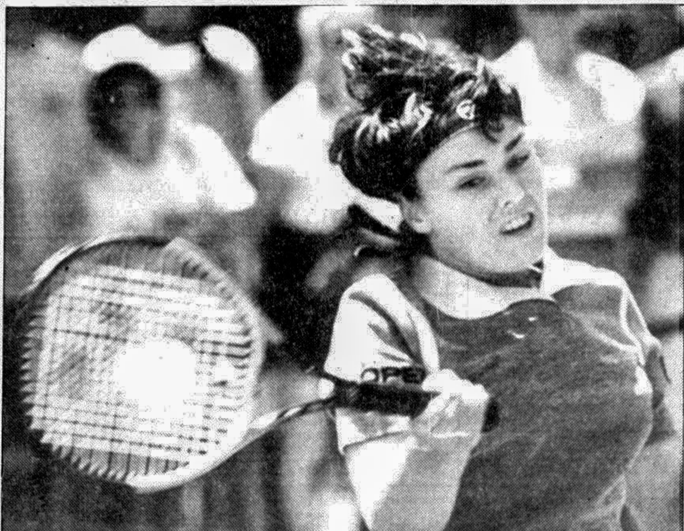
World No 1 Martina Hingis executes a forehand against Serena Williams of the United States during their Acura Classic quarterfinal match at Manhattan Beach, California on August 14. Hingis won 6-4, 6-1.