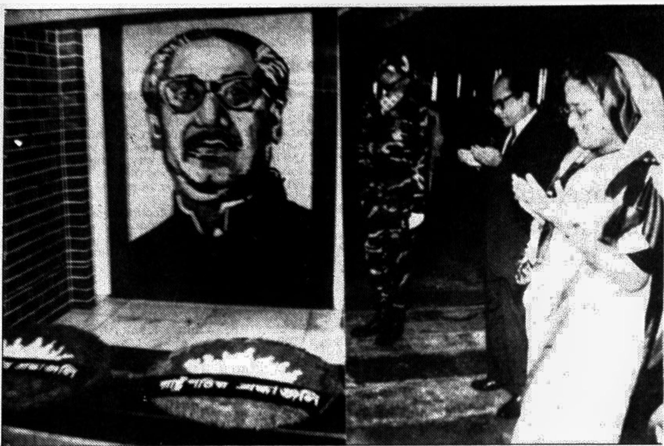
President Shahabuddin Ahmed and Prime Minister Sheikh Hasina offering munajat after placing wreaths at the portrait of Bangabandhu Sheikh Mujibur Rahman at Bangabandhu Museum in the city on National Mourning Day Saturday.