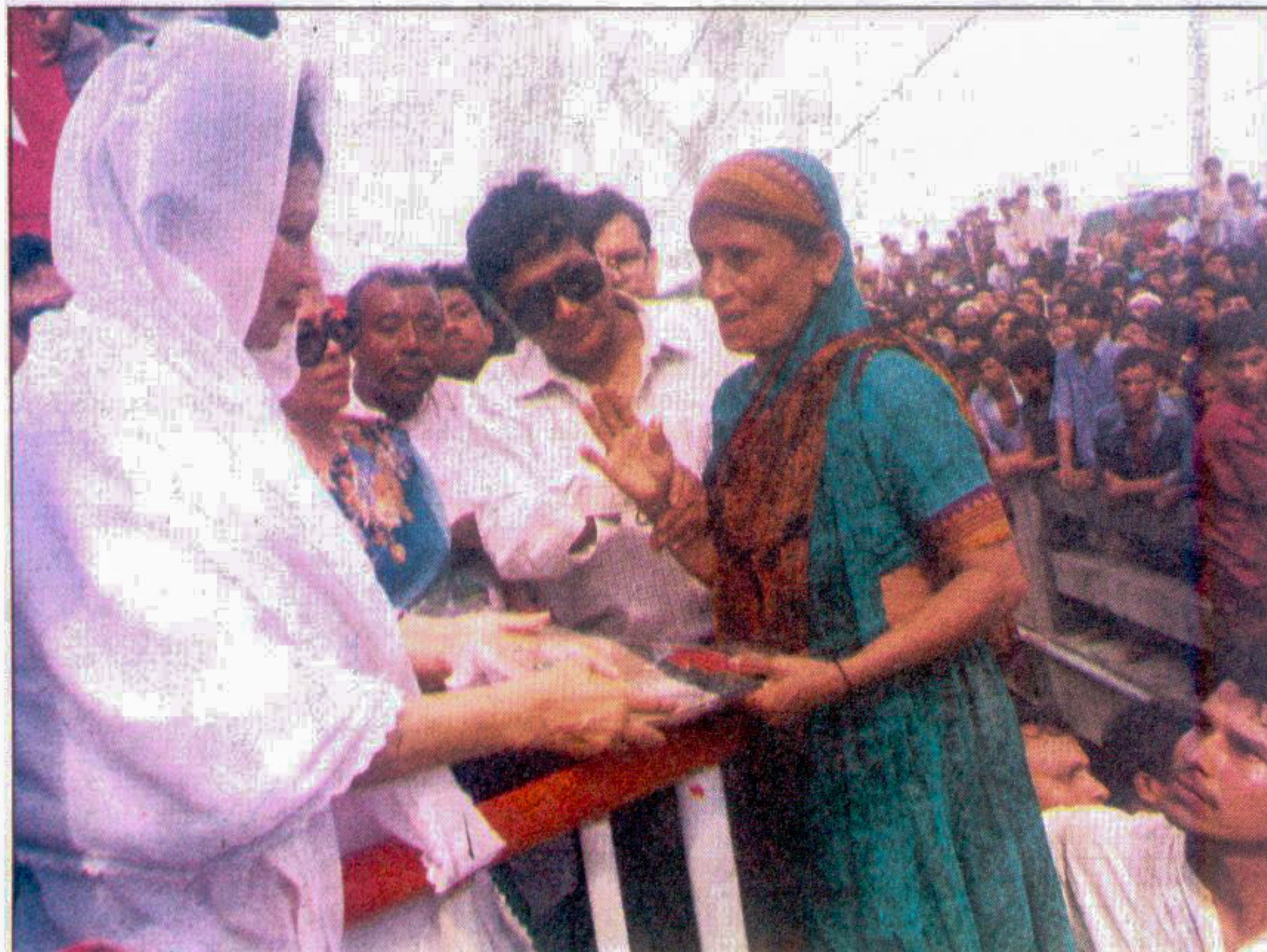
Leader of the Opposition in Parliament and BNP Chairperson Begum Khaleda Zia distributing relief goods among the flood victims at Balur Char in Munshiganj yesterday.

From Page 1 sional statement. Police filed a case under the Woman and Child Repression Control Act and submitted the chargesheet against the accused. Judge Mainul Islam Chowdhury of the special court on woman and child repression control gave the verdict after examining the witnesses and records.