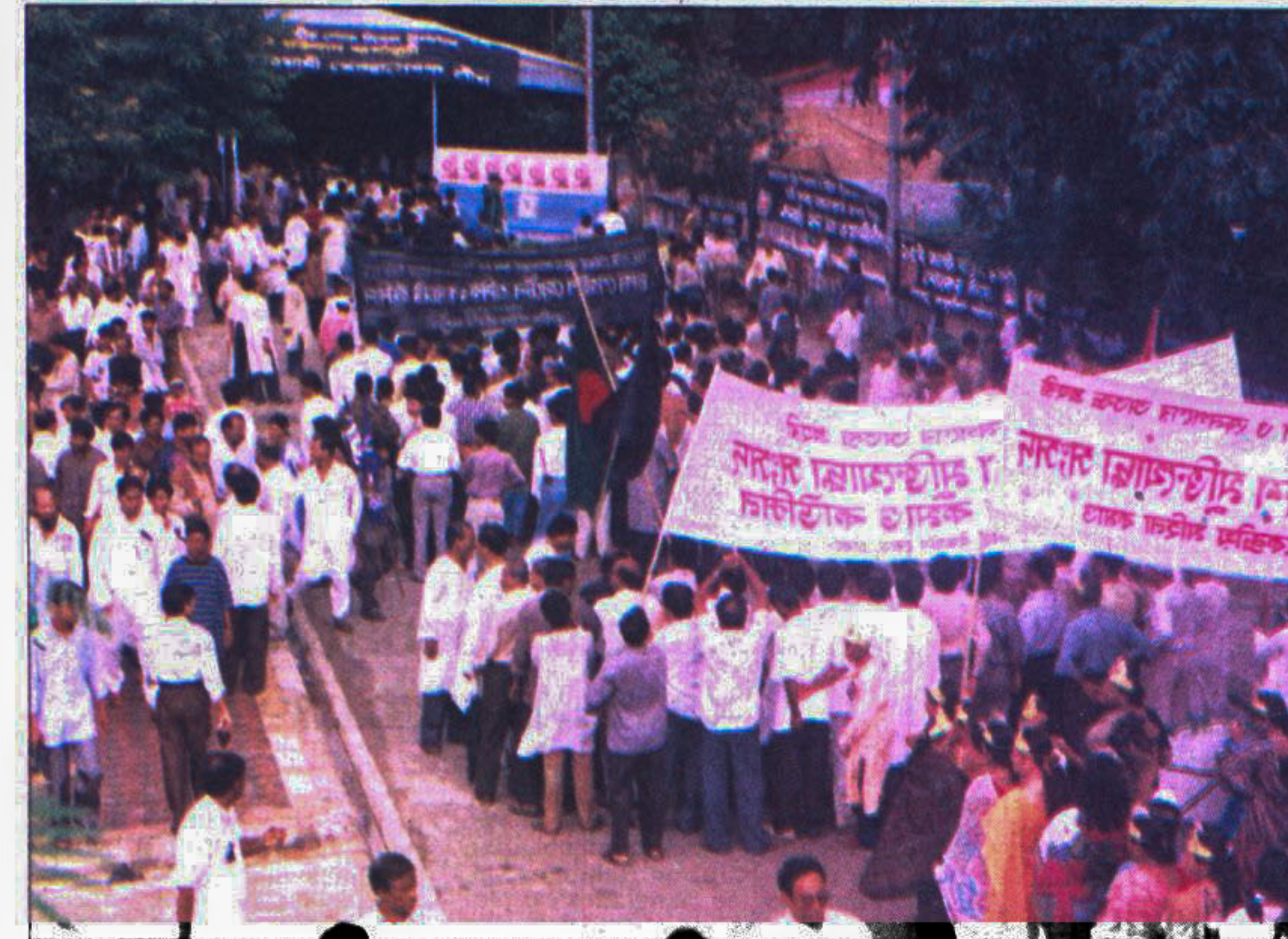
People thronged the Bangabandhu Museum in the city to pay homage to Bangabandhu Sheikh Mujibur Rahman on National Mourning Day Saturday.