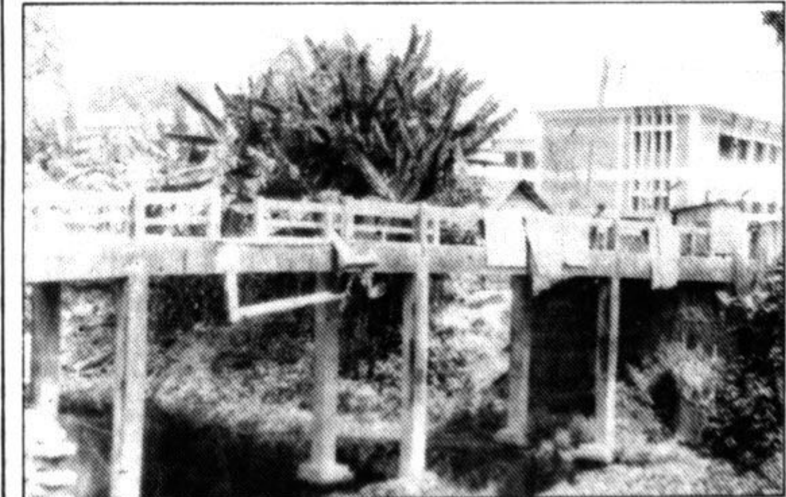
NATORE: Liaquat Bridge on the river Narod is in bad shape.