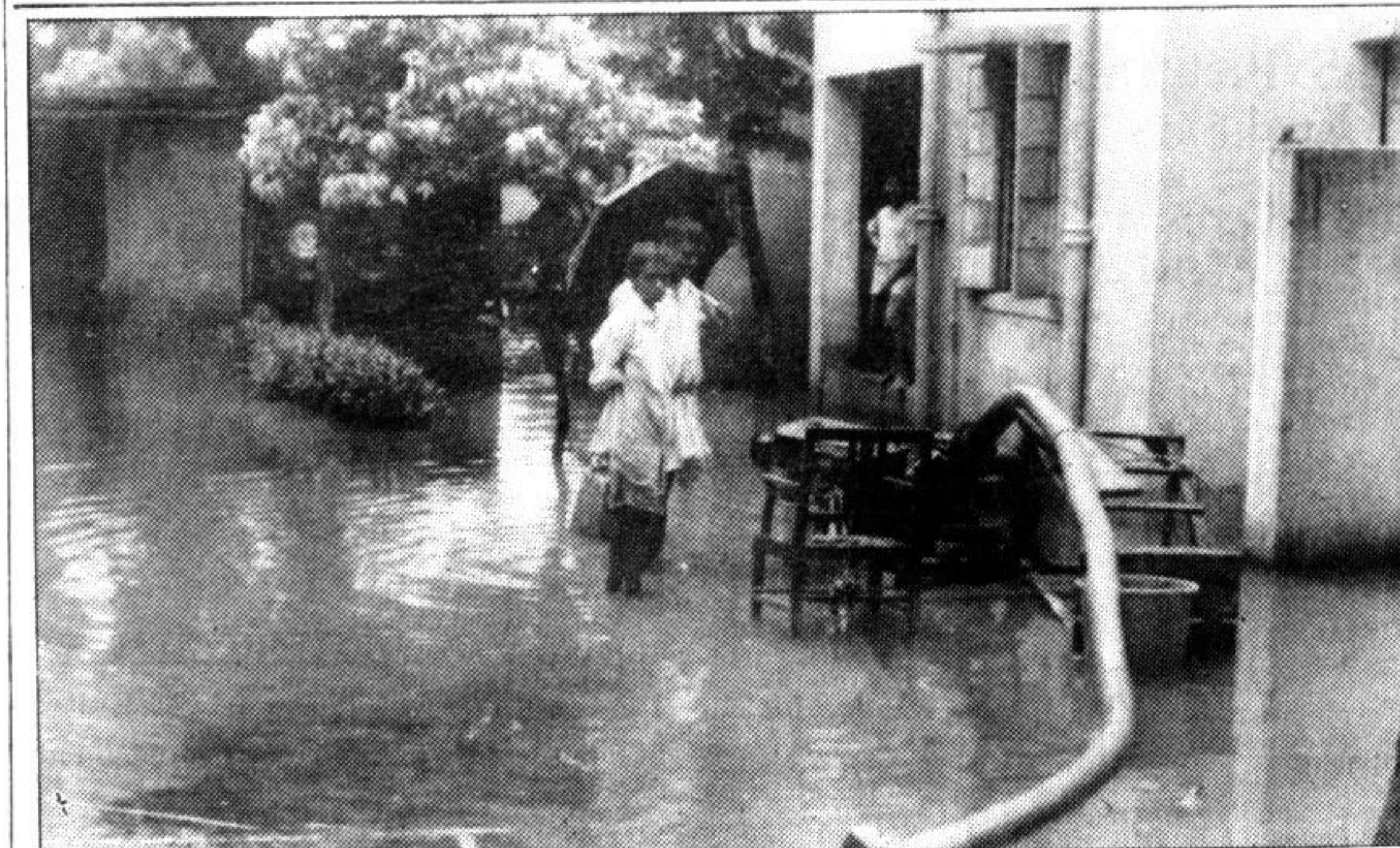
Stagnant rain water is being pumped out from a house at Minto Road in the city yesterday.

India accuses Sharif's government of arming Muslim guerrillas fighting for Kashmir's independence or its merger with Islamic Pakistan, while Pakistan accuses India of violating human rights in its crackdown on the militants. Islamabad says it offers only political and moral support to Kashmir's indigenous movement, and Sharif said that support would continue as long as "Kashmiris are victims of Indian atrocities." Sharif on Friday also defended his decision to answer Indian nuclear weapons tests in May with his own tests.