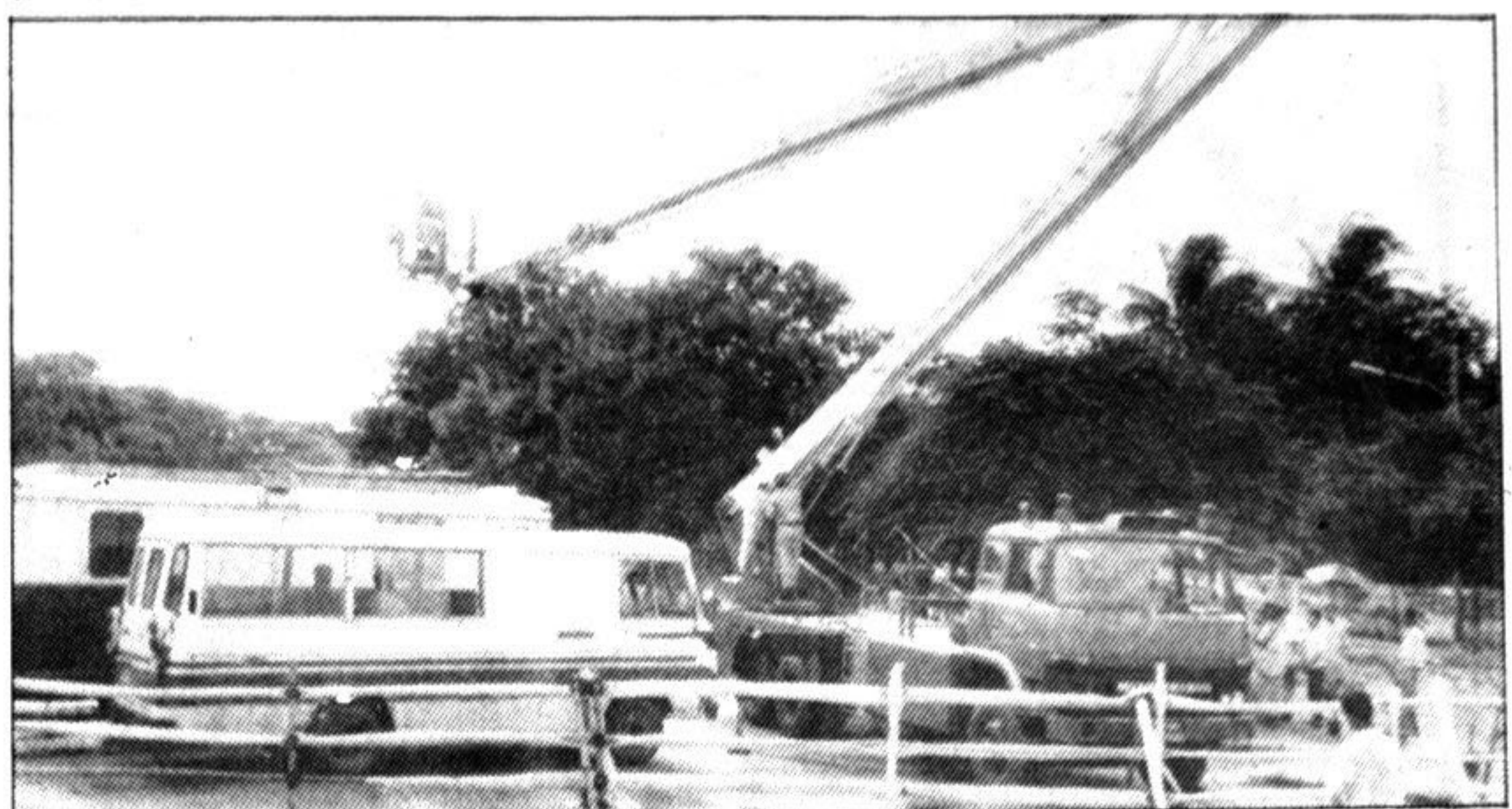
All preparations have been completed to telecast live the National Mourning Day programme today from Bangabandhu Museum at Road No 32 in Dhanmondi.

He warned however that his fighters were in "high spirits" saying the militia would easily overrun the opposition-held northern plains to reach the strategic Salang valley, 50 miles north of Kabul. The Taliban militia and loyalists of the ousted Afghan government's military strongman Ahmad Shah Masood have been positioned at 15 miles