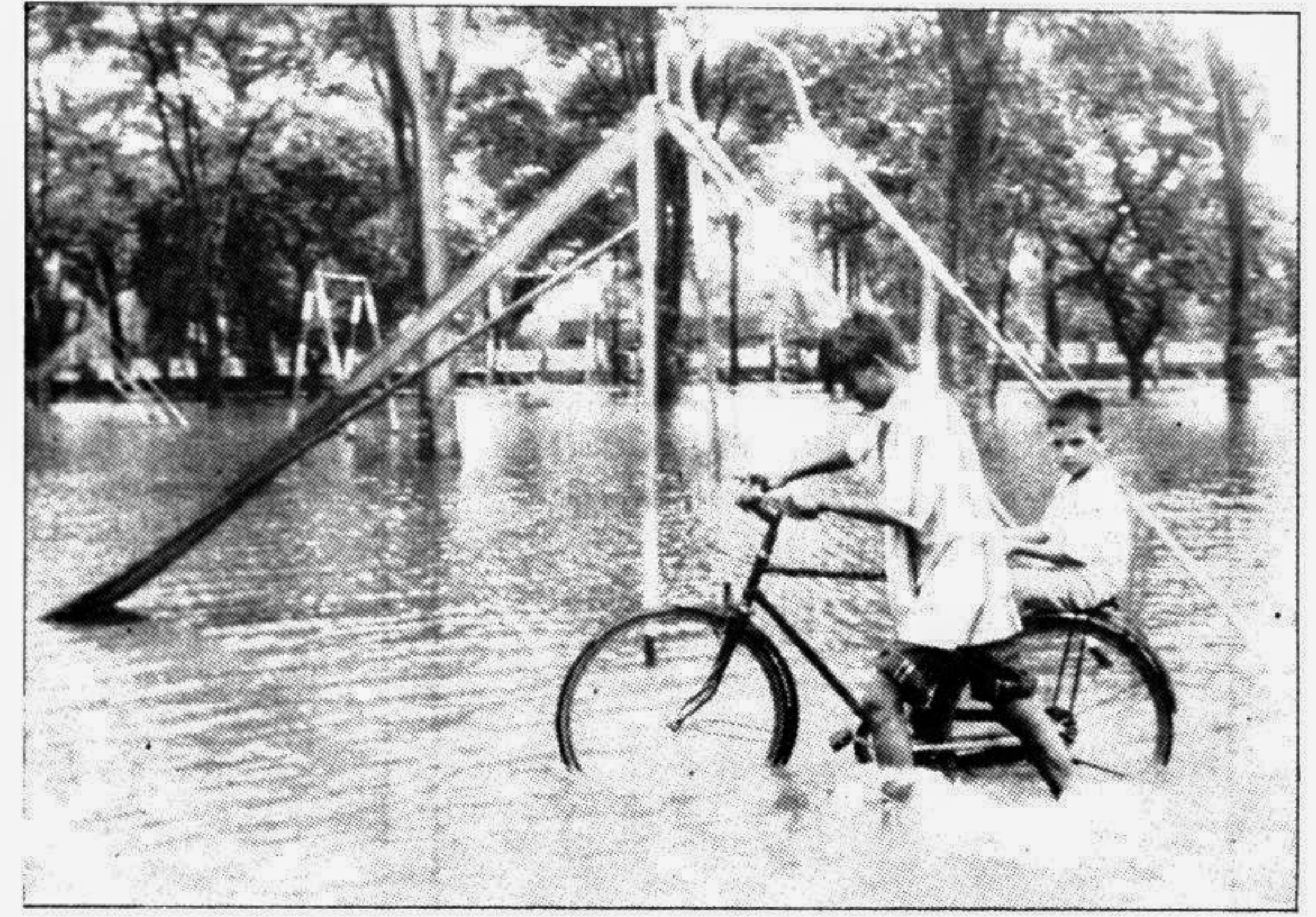
Rain water has flooded the Ramna Park area in the city.

BORGUNA, Aug 14: At least 100 fishermen are missing in the Bay after 21 fishing trawlers and boats capsized in high waves due to downpour and storm in last four days, according to sources. The capsized trawlers were identified as FB Patharghata-2, FB Patharghata-5, FB Shajahan, FB Monju, FB Ali Kadam, FB Josna, FB Farhana, FB Jalkonna-4, FB Rahat Khan, FB Sadia, and FB Afrin. The names of the capsized boats could not be known immediately. Some 50 fishermen of the trawlers and boats capsized could swim ashore. They were admitted to the local hospitals.