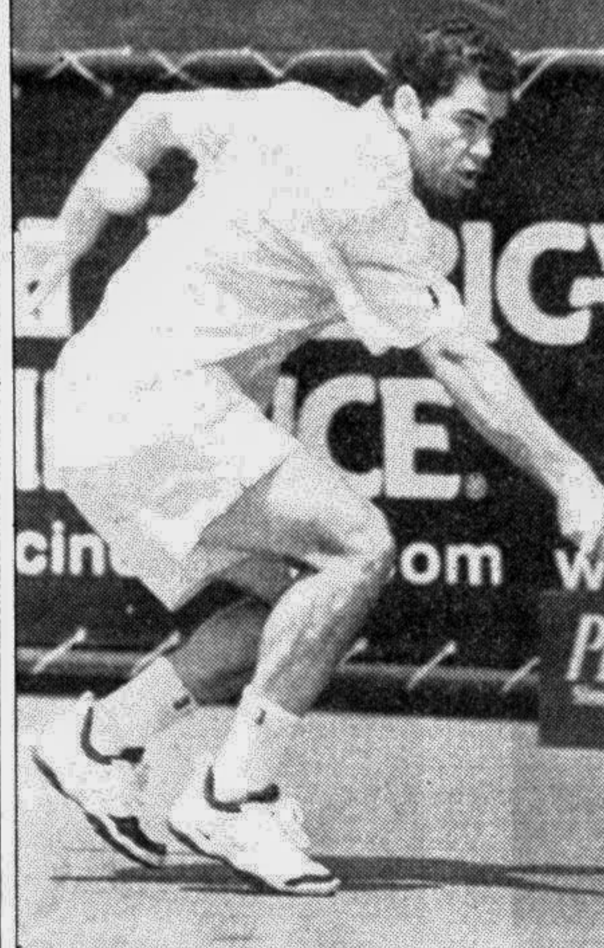
Pete Sampras of the United States plays a backhand against Martin Damm of the Czech Republic during their ATP championships encounter at Mason Ohio on August 12. Sampras won 6-4, 6-2.

"It doesn't speak for his potential, just his results."