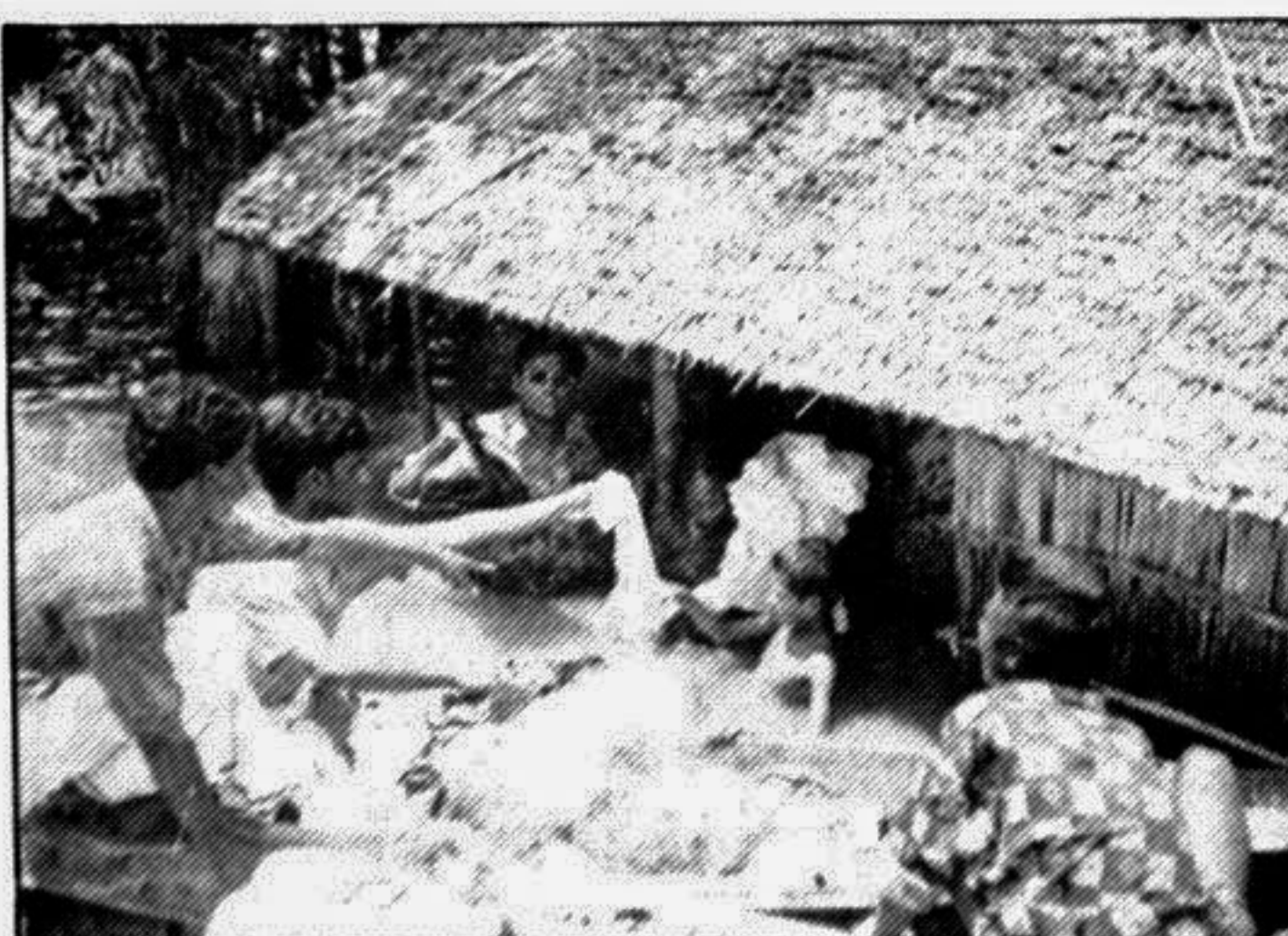
MANIKGANJ: Tejgunipara Peerma Jame Masjid Islami Library distributed relief materials among the flood affected people of Ali Nagar, Chandan Nagar, Raj Nagar, Zarnija, Waiz Nagar and Chandadar villages under Shingair thana in Manikganj. The relief materials included rice, biscuits, drinking saline and old clothes.

Sources said the construction work was started on 1.5 acres of land in 1996 with an estimated expenditure of Tk 16.6 crore. In the mean time, 96 per cent work has already been completed. After the completion of the construction of the head office, the network of the company will get further boost.