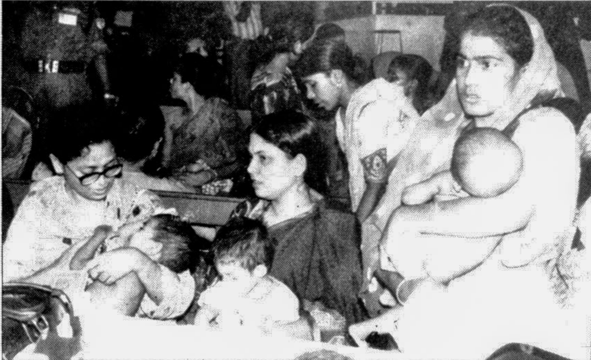
Rush of diarrhoea patients, mostly children, at the ICDDR,B in the city yesterday.

She conveyed her sympathy to the members of the bereaved family and prayed for the salvation of the departed soul.