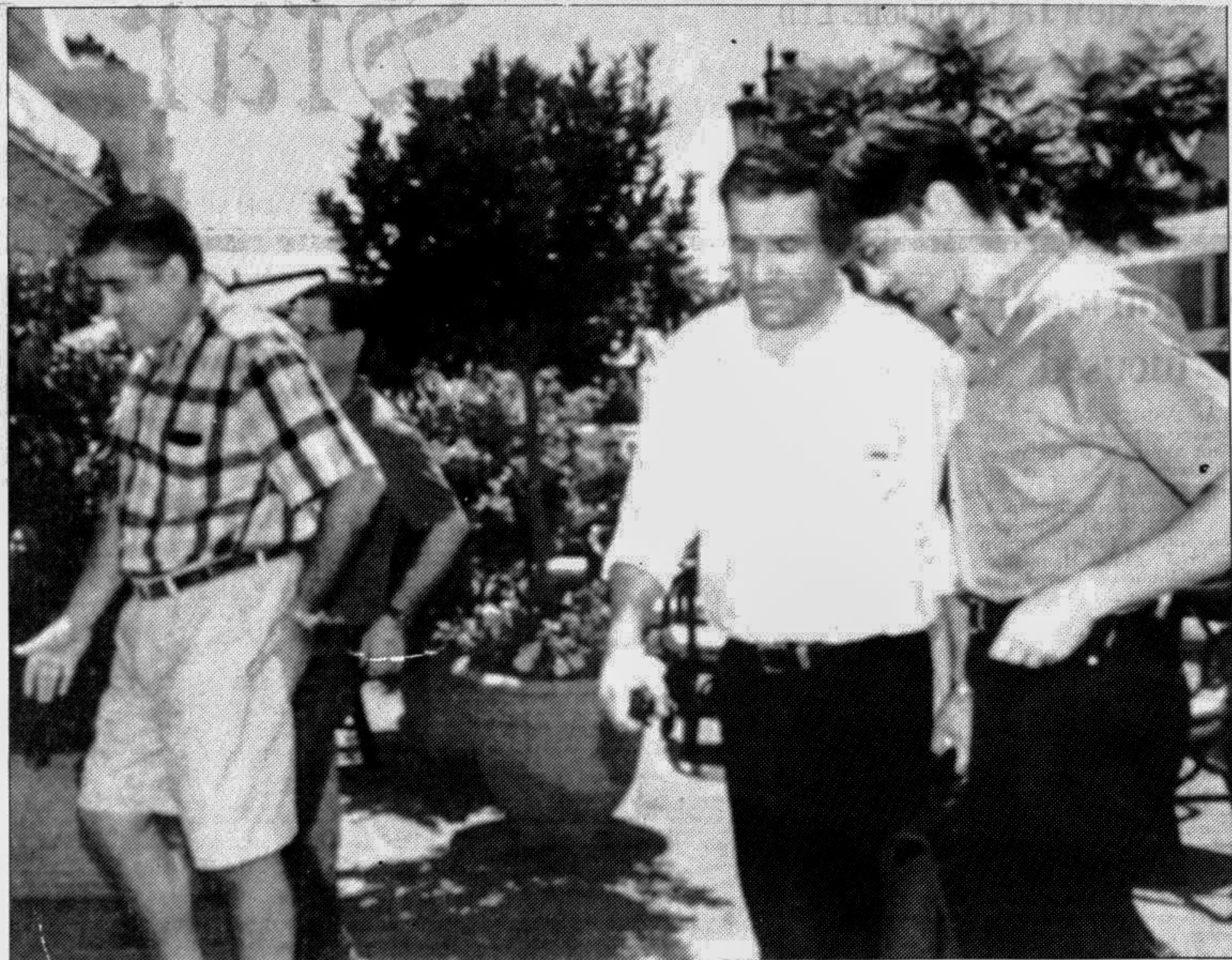
JARNI'S MADRID JOURNEY: Croatia's star left back Robert Jarni (R) discusses something with Real Madrid president Florentino Sanz (C) at Marbella, Spain on August 10. Jarni is linked to a possible move to the Madrid giants from his current club Real Betis.

Corinthians have won their first four games in the Brazilian championship and on Saturday hammered Atletico Mineiro 5-1 away. If his appointment is confirmed, Luxemburgo will step in for veteran Mario Zagallo, who was fired two weeks ago despite taking Brazil to the final of the World Cup in France last month. The first players for the new national team should be named some time in September for the three or four exhibition matches remaining this year. Luxemburgo will not leave Corinthians before the end of the national championships. Other leading candidates for the job include Paulo Cesar Carpegiani, who led Paraguay to the second round in the World Cup, and Carlos Alberto Parralira, who led Brazil to World Cup victory in the United States four years ago. Antonio Lopes, a former police detective who coaches Brazilian champions Vasco da Gama, and Palmeiras coach Luiz Felipe Scolari have also been suggested.