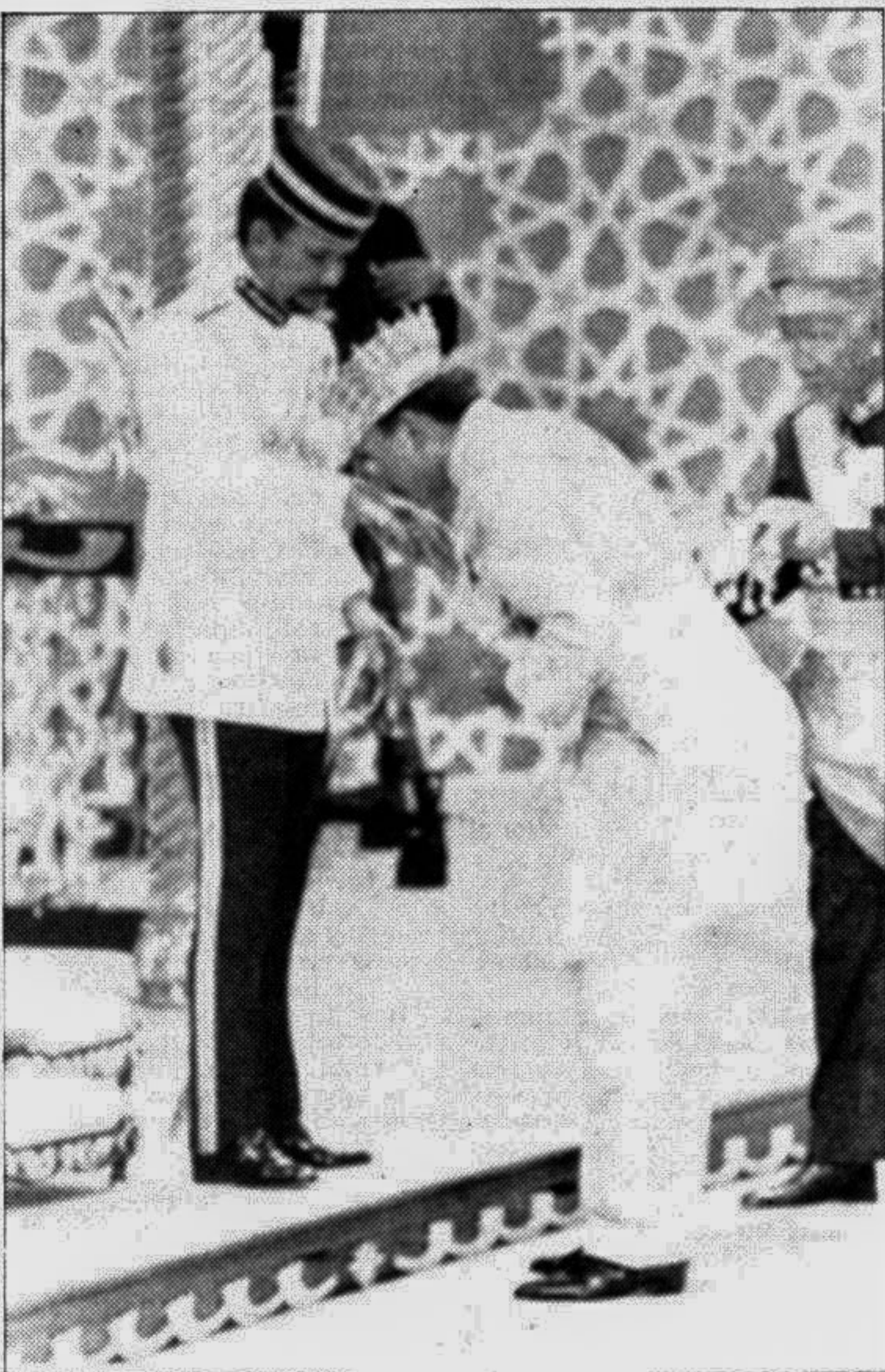
Brunei's new crown prince kisses the hand of his father, Sultan Hassanul Bolqiah, after he was passed on the mantle of ruling Brunei after his father Monday. He was given a traditional Malay knife to proclaim him the hierarch to Brunei's throne in Bandar Seri Begawan, 1998 in Brunei Darussalam.

A three-day meeting of the secretaries general of SAARC parliaments will begin in Dhaka tomorrow, reports BSS.