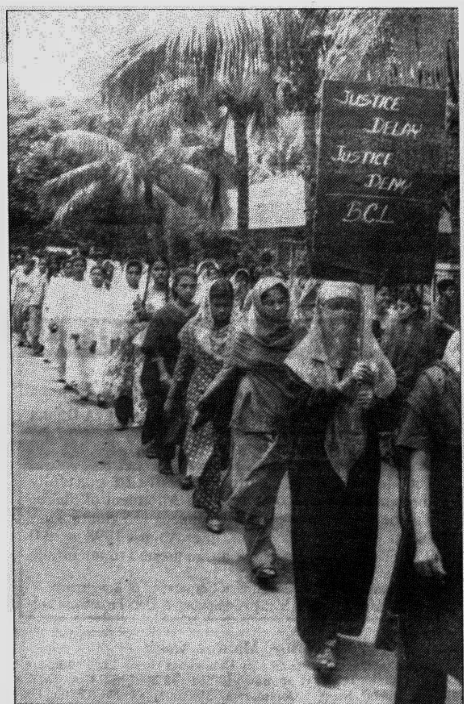
BCL brought out a mourning procession in the city yesterday to mark National Mourning Day on August 15.