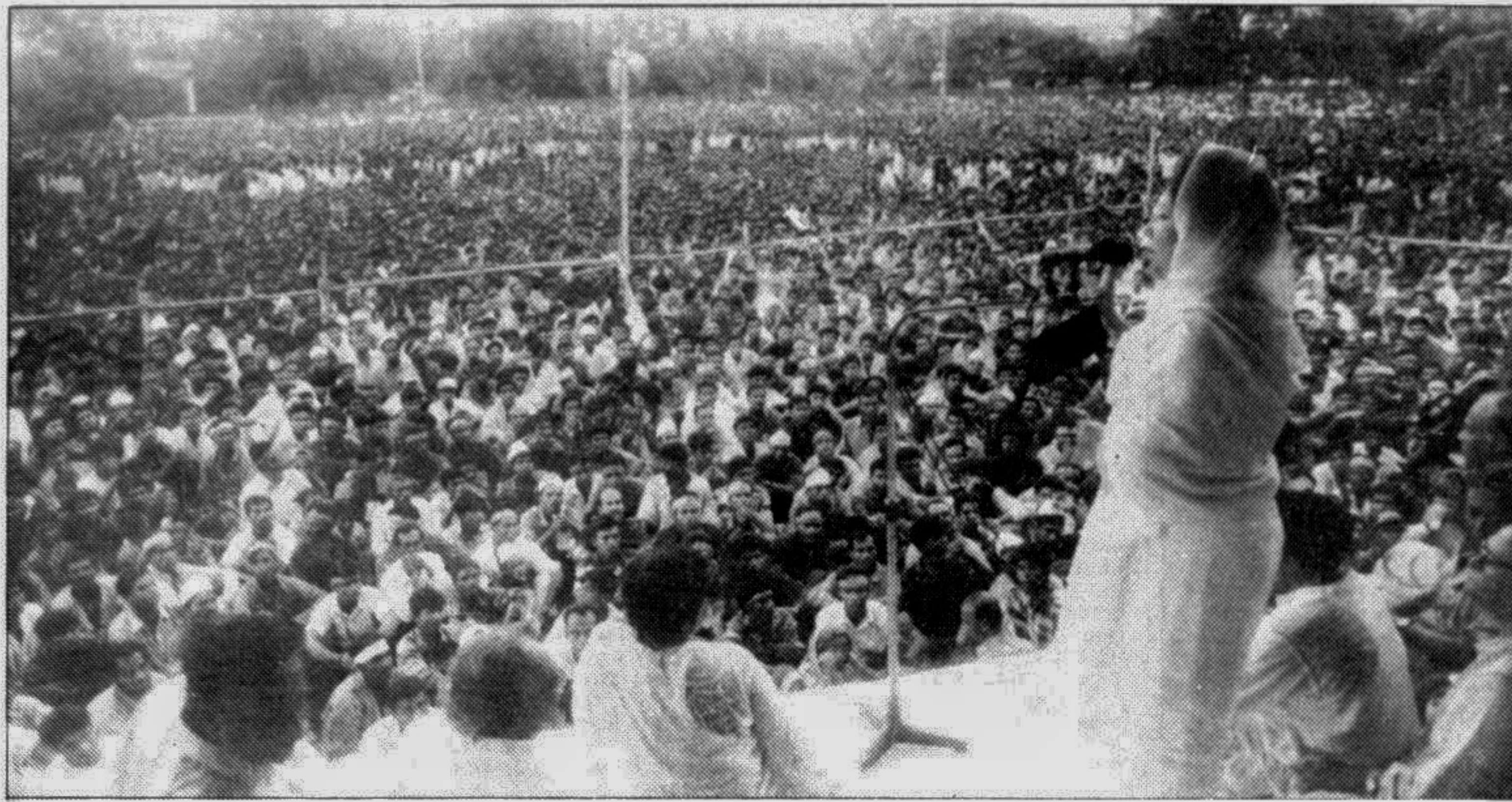
BNP chairperson Begum Khaleida Zia addressing a public meeting at Devishahar in Satkhira Saturday.