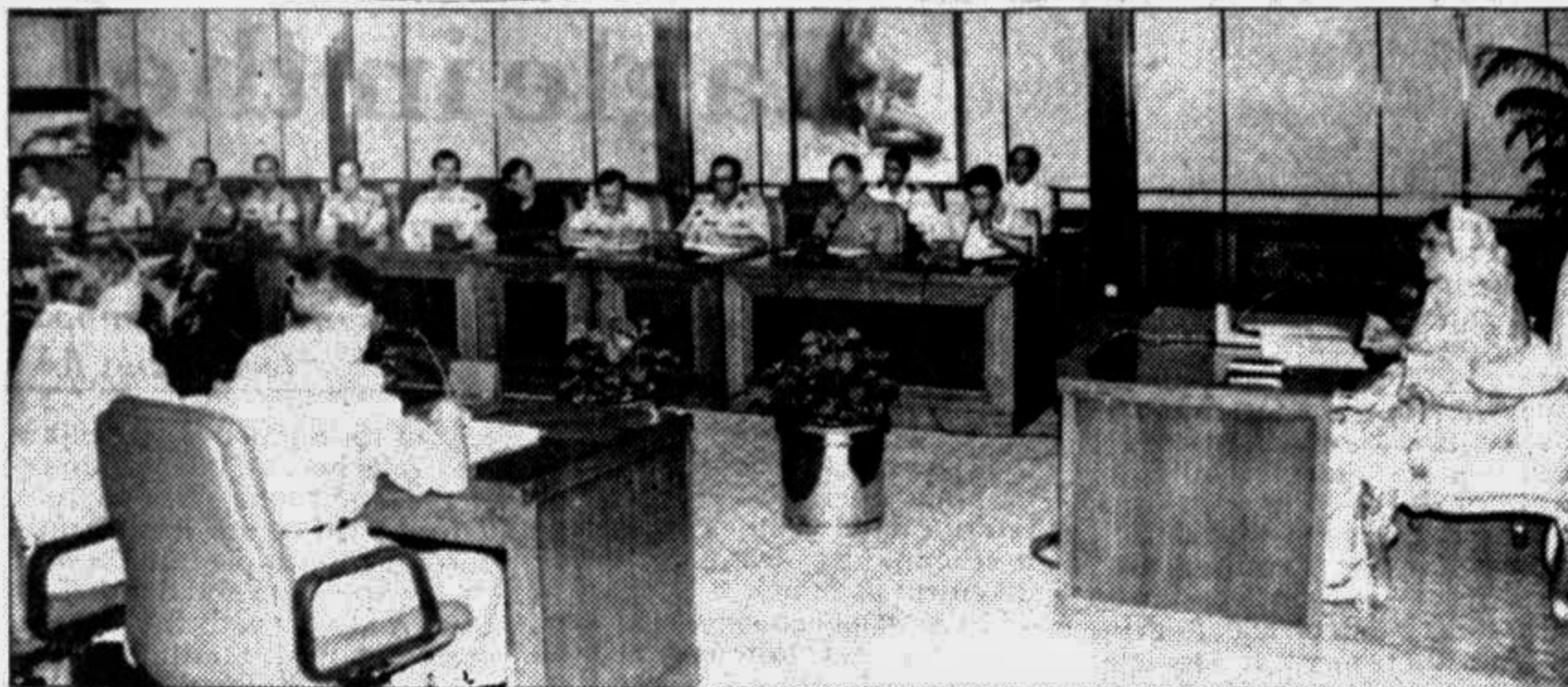
Leaders of BCS (Police) Association called on Prime Minister Sheikh Hasina at the International Conference Centre in the city yesterday.

The duration of 'A Night to Remember' is 123 minutes and it will be screened in 35 mm black and white format. The story is about the 'unsinkable' Titanic and it was told from the day in April, 1912, when the ship began her maiden voyage, until five days later, when she went (the ship) down in the middle of the Atlantic.