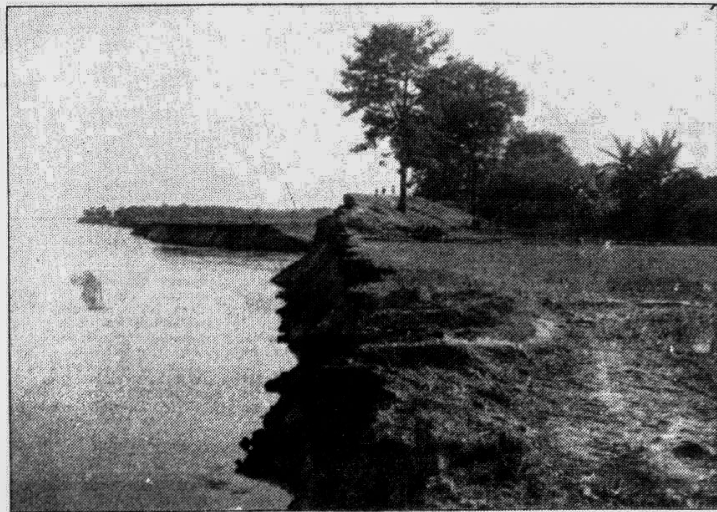
RANGPUR: A vital road at Nohali union under Gangachara thana of the district is being eroded by the river Teesta.

Most affected areas are Jagambar, Parankhali, Sat-