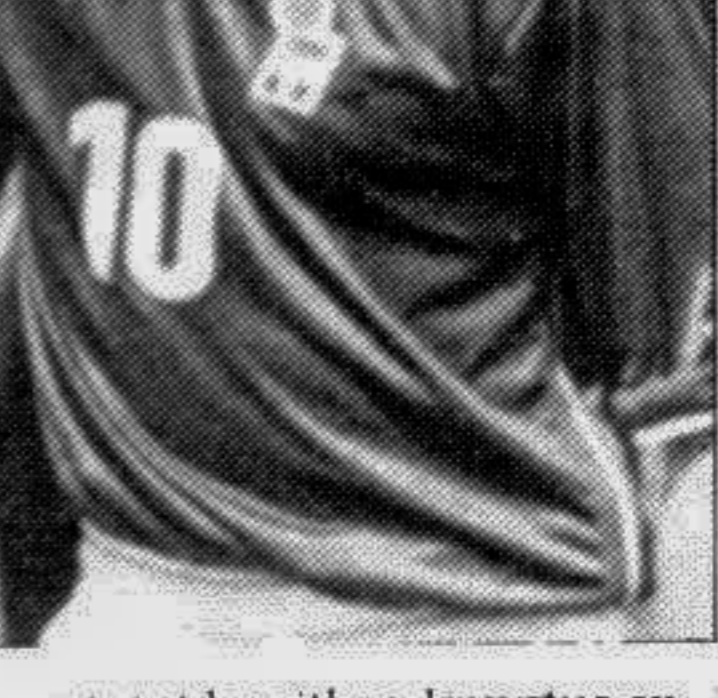
comment by either Juventus executives or players on the Zeman affair, following a meeting on Thursday night to discuss the issue. Vialli was meanwhile tackled on the subject as Chelsea's player-manager prepared for Friday evening's friendly against Parma at Palermo. But he answered the question with a terse: "I'm not going to discuss it."

Udine, where they are preparing for Friday night's three-way tournament of 45-minute matches with Udinese and Inter. A spokesman for the Turin club said there would be no