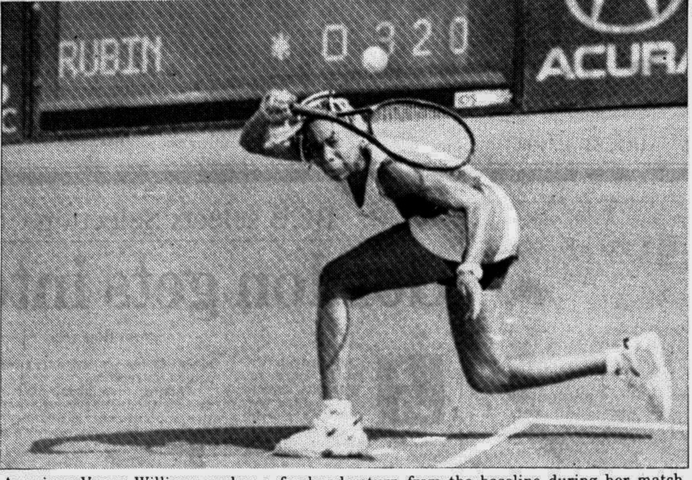
American Venus Williams makes a forehand return from the baseline during her match against compatriot Chanda Rubin at the Toshiba Classic in California on August 6. Venus won 6-3, 6-2.