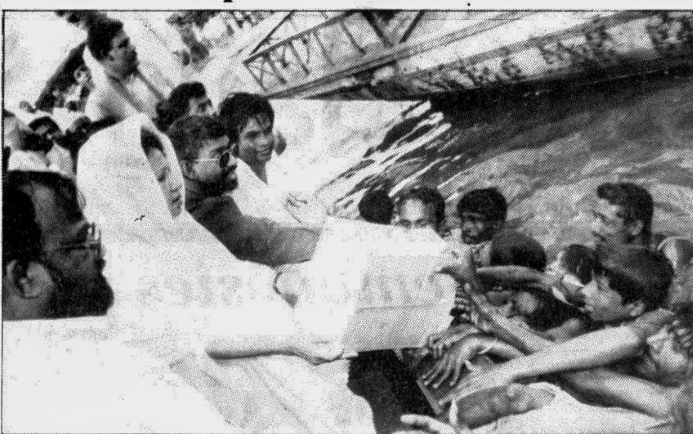
BNP chairperson and Leader of the Opposition in Parliament Begum Khaleda Zia distributing relief among the flood-affected people at Keraniganj yesterday.