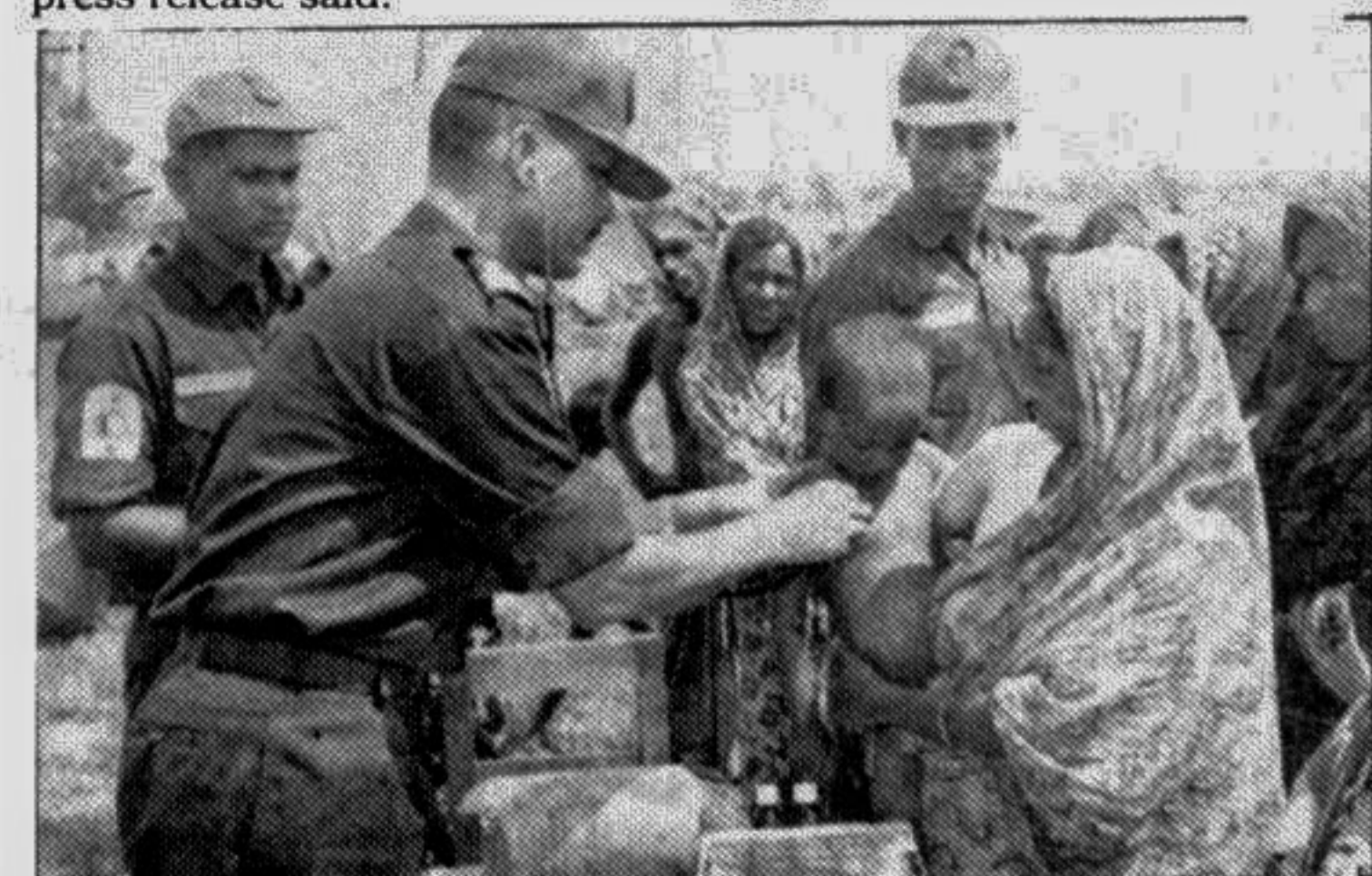
A medical team of Bangladesh Navy provided medical assistance to the flood-affected people at Mugdapara in the city yesterday.

On the first day, 5 kg of rice per family was distributed among 320 flood-affected families.