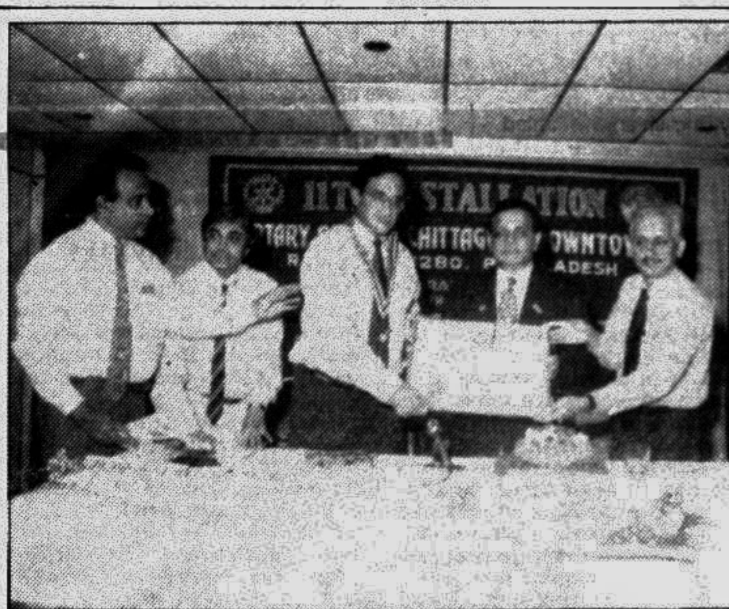
The 11th installation ceremony of Rotary Club of Chittagong Downtown was held recently.