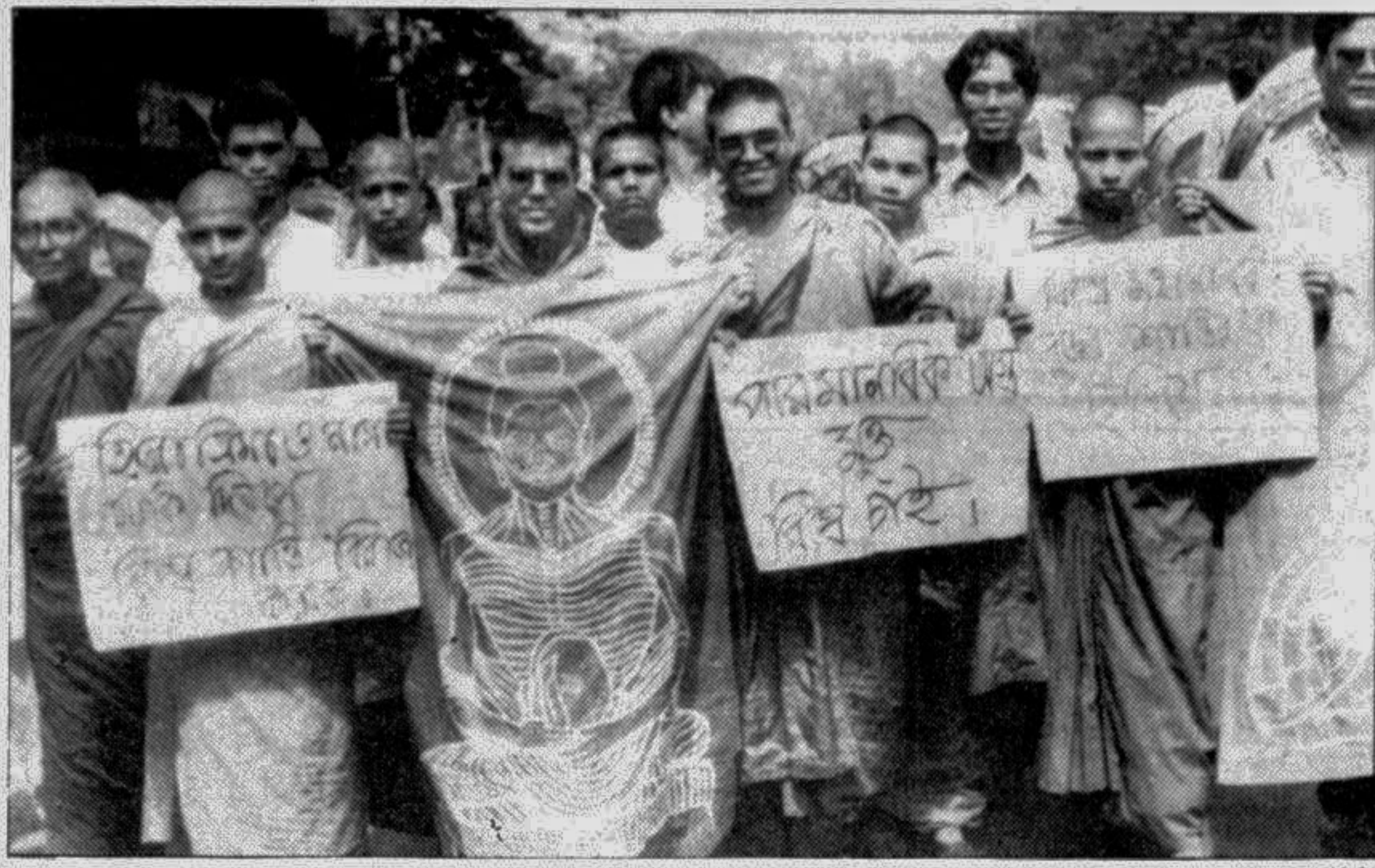
The Buddhist community brought out a peace procession commemorating Hiroshima Day '98 in the city yesterday.