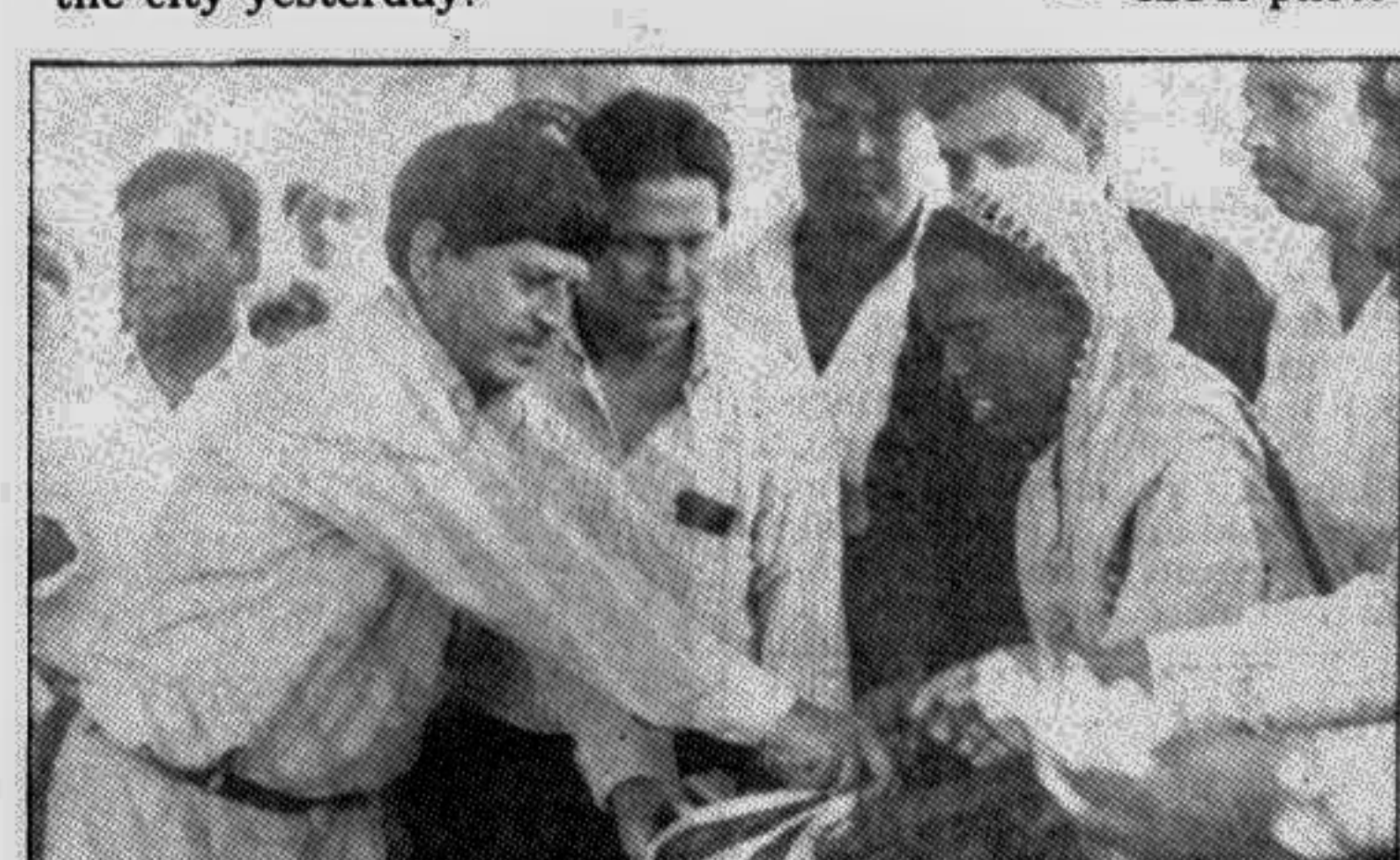
Narayanganj district unit command of Bangladesh Muktijoddha Sangsad distributed relief among flood victims at Panchaboti yesterday.