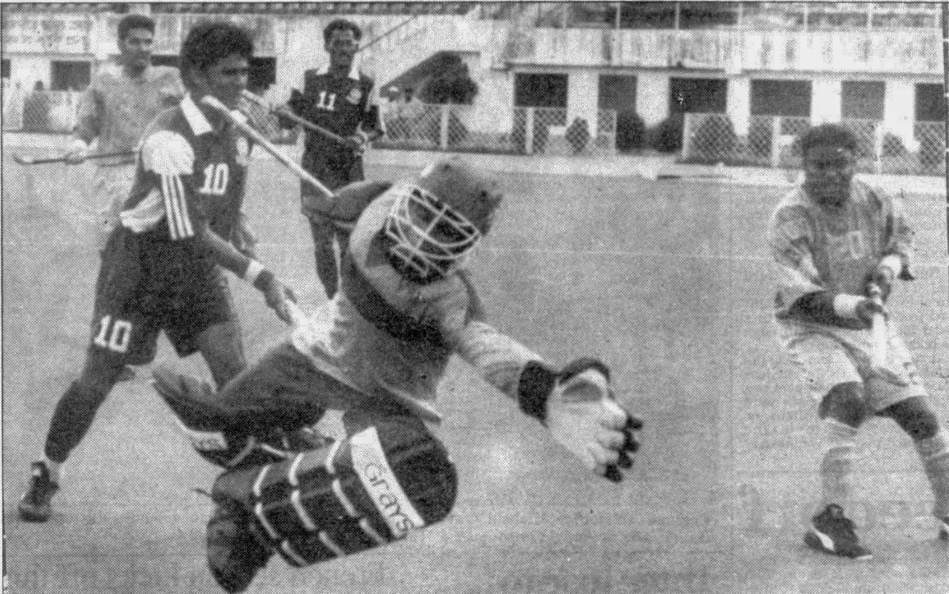
Scene from the 2nd Jiban Bima Club Cup hockey tournament opener between Mohammedan and Bangladesh Sporting Club at the National Hockey Stadium yesterday afternoon.

Local media reports quoted the Greek athletics federation as saying Tsentemidou's first sample was positive. The athlete, who faces a mandatory two-year ban, will be asked if she wants her second sample to be tested.