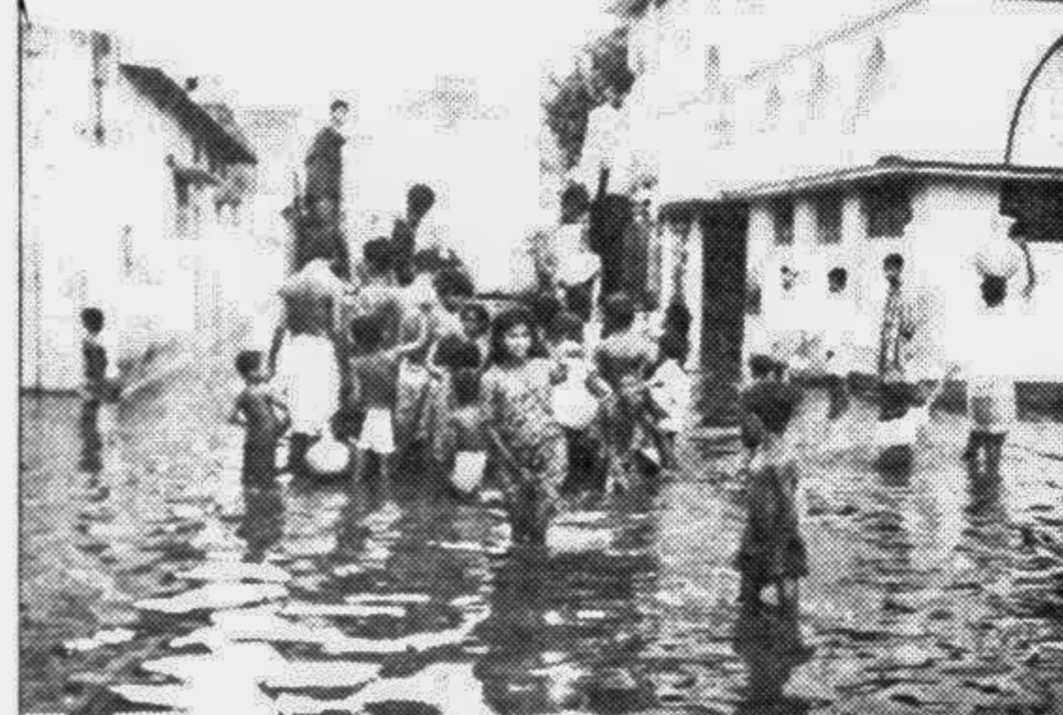
CARE Bangladesh has been distributing pure water in the flood-affected areas of Maradia, Shipahibagh, Bhuiyanpara, Goran and Sabujbagh in the city, through its partner NGO Bangladesh Nari Progoti Sangha and Emergency Support Corp with assistance from WASA.