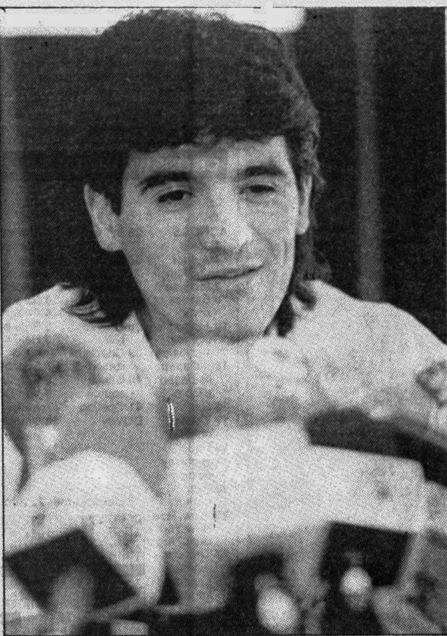
Sampdoria's hot signing Ariel Ortega speaking at a farewell press conference at his former club Valencia of Spain on August 3.

Kluyvert, who joined the Serie A club from Ajax Amsterdam, in the summer of 1997, agreed to a modest increase in his salary, details of which were not disclosed. The duration of his contract, which runs until June 30, 2001, was left unchanged.