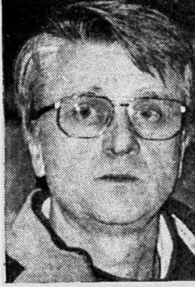
Aime Jacquet (Former French soccer coach) 'The World Cup was a moment of national communion.'