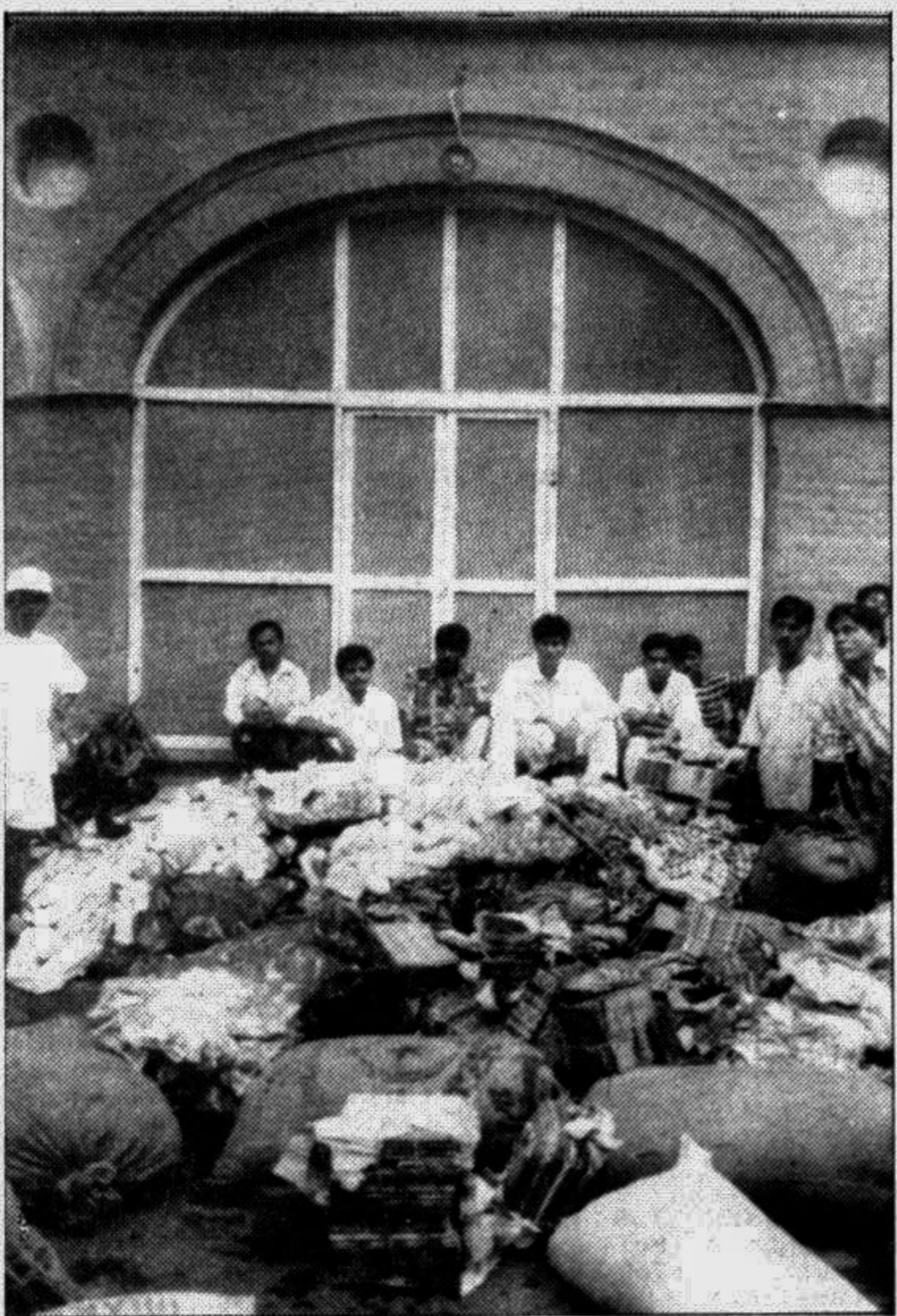
The relief goods which were supposed to be distributed yesterday remained stacked outside the Minto Road official residence of the Leader of the Opposition in Parliament. - Star photo

From Page 1 103.2 mm at Panchpukuria, 85 mm at Sunamganj, 57 mm at Kaunia, 53.2 mm at Rangamati, 52 mm each at Bhaibar and Kurigram and 51.5 mm at Bandarban during the last 24 hours till 9 am yesterday. Meanwhile, Relief Ministry control room said there was no report of flood related death yesterday keeping the death toll unchanged at 256. The control room at Health Directorate said diarrhoea claimed three more lives in the last 24 hours and affected another 1,466 people in 37 flood-hit districts. The flood situation is improving very slowly in Dhaka, Narayaniganj, Munshiganj, Manikganj, Mymensingh, Madaripur, Rajbari and Pabna districts, said the Relief Ministry officials. The situation is improving also in Jamalpur, Sirajganj, Netrokona, Faridpur, Sherpur, Chandpur, Brahmanbaria, Bogra, Gaibandha, Kushtia, Comilla, Sunamganj and Habiganj districts. Districts where the situation has already become normal are Tangail, Lalmonirhat, Rangpur, Nilphamari, Joypurhat, Naogaon, Chittagong, Rangamati, Chandpur, Cox's Bazar, Bandarban, Feni, Magura and Moulvibazar. Relief Ministry officials said some 1.74 crore people have been affected by the ongoing flooding. Of them, only 1.25 lakh took shelter in 429 centres.