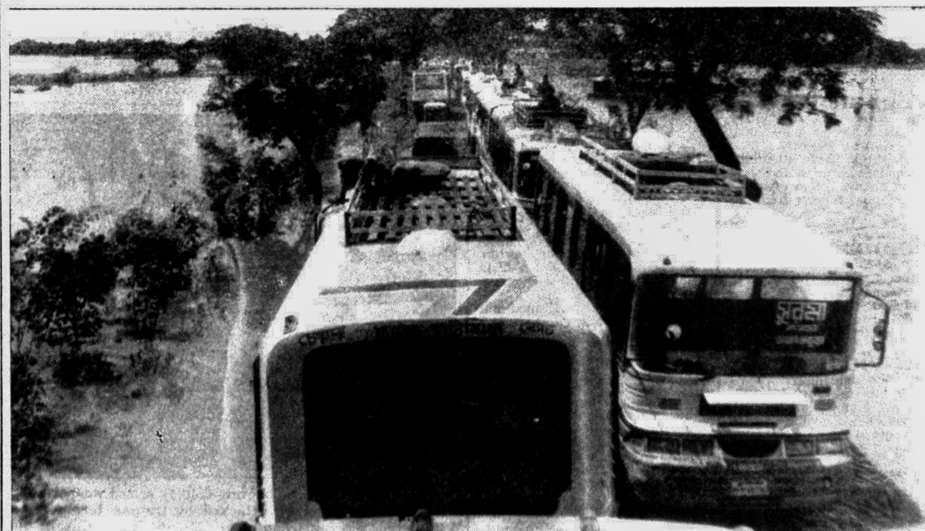
NARAYANGANJ: Traffic jam is now a regular feature on Dhaka-Chittagong highway due to ongoing flood. This photo was taken from near village Jangla of Bandar thana in the district recently.