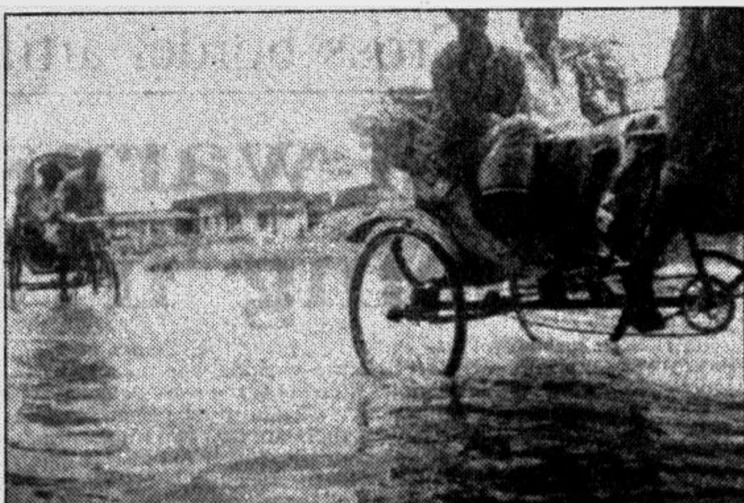
SYLHET: Flood waters have inundated Jagannathpur thana headquarters.

MEHERPUR, Aug 3: The Agriculture Extension Department has taken up an Intensive Autumn Crop Cultivation (IACC) Programme in the district in the current Kharif season, reports BSS. Under the programme around 12,500 hectares have been brought under Transplanted Aman crop cultivation of which 10,000 hectares are cultivated with High Yielding Variety and the rest 2,500 hectares with local variety (HYV). BADC has distributed about 800 tonnes of HYV aman seed of BR-11, BR-26, BR-30 and BR-32 among the farmers in Meherpur district.