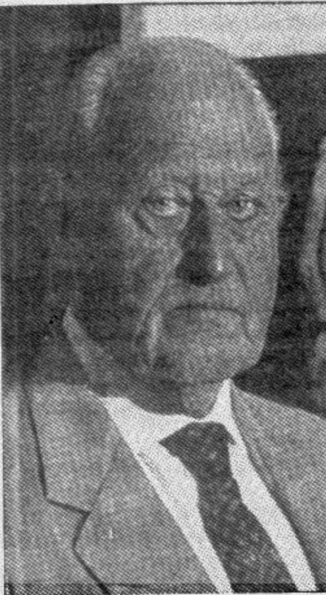
(Joao Havelange) (Former FIFA president) "Football is not just a sport. It is the only universal link that there is. It is the most democratic of all sports, we all talk to each other, in a football stadium everyone is equal."