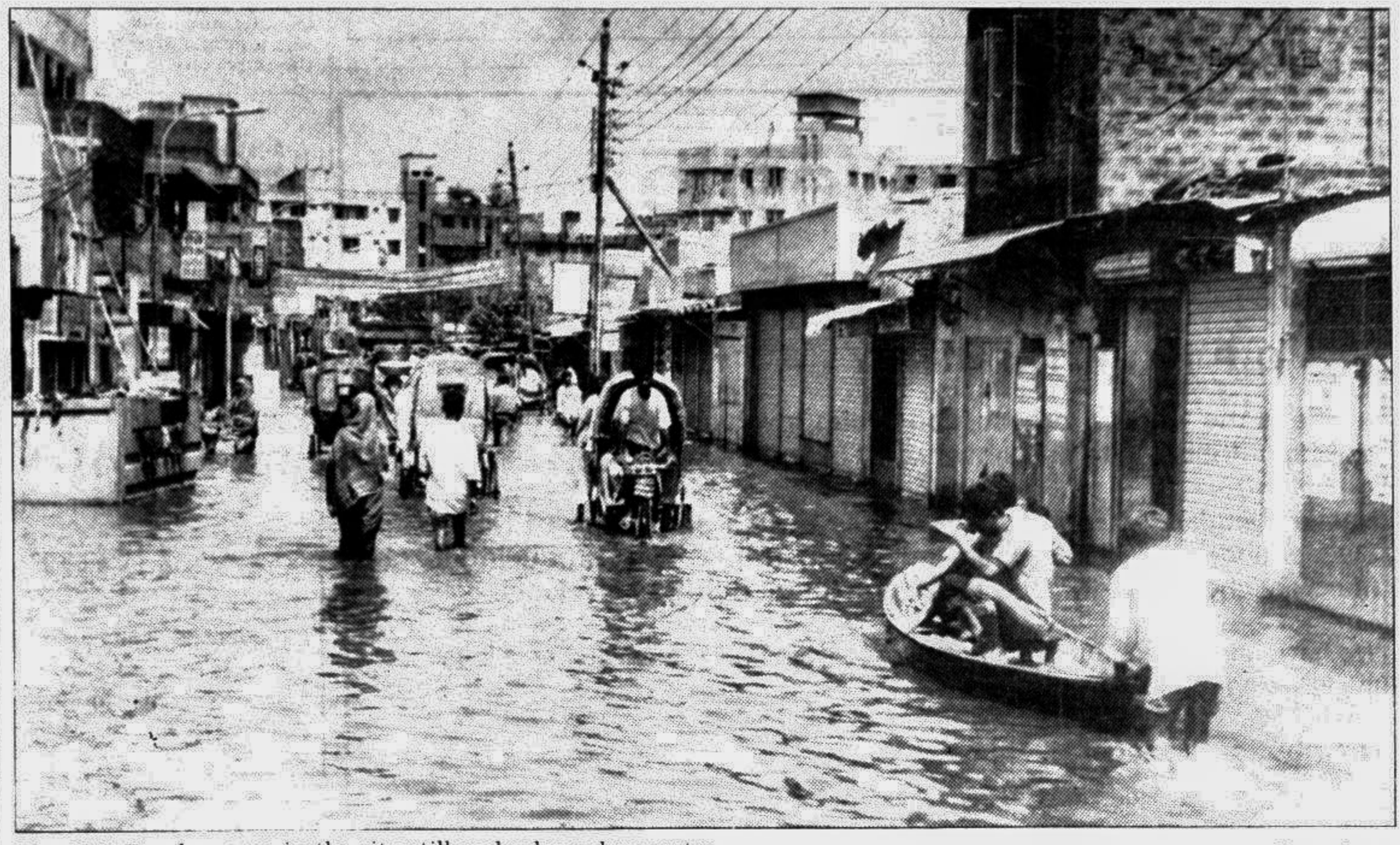
Flood-hit Basabo area in the city still under knee-deep water.

A government handout last night termed as 'concocted, distorted and exaggerated' a report published in the daily Janakantha on the stripping of clothes of two young women in public in Bagha thana under Rajshahi district, reports BSS. The handout said, 'attention of the government has been drawn to two reports of the said daily published on August 1 and August 2 concerning stripping of clothes of two women by terrorists and non-acceptance of FIR by the police station on the same incident.'