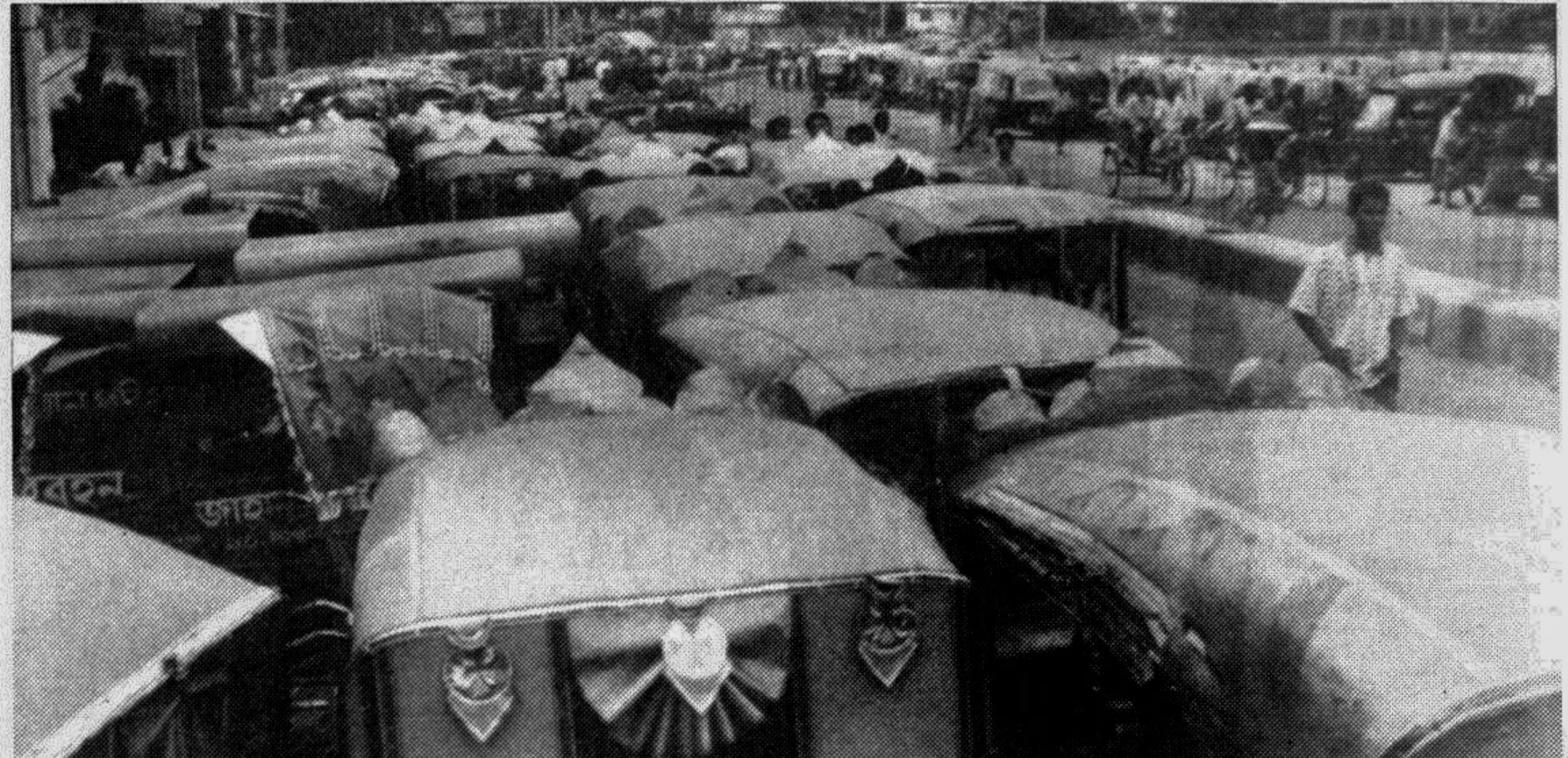
STRAYED ON THE STREET: The auto-rickshaw drivers and owners, who used to park their vehicles at city's Basabo, are now-a-days looking for new parking lots since the rising flood waters have already submerged the old places. The photo shows a temporary arrangement on the Bishwa Road, which, according to the local people, has been causing severe traffic congestions in the area.