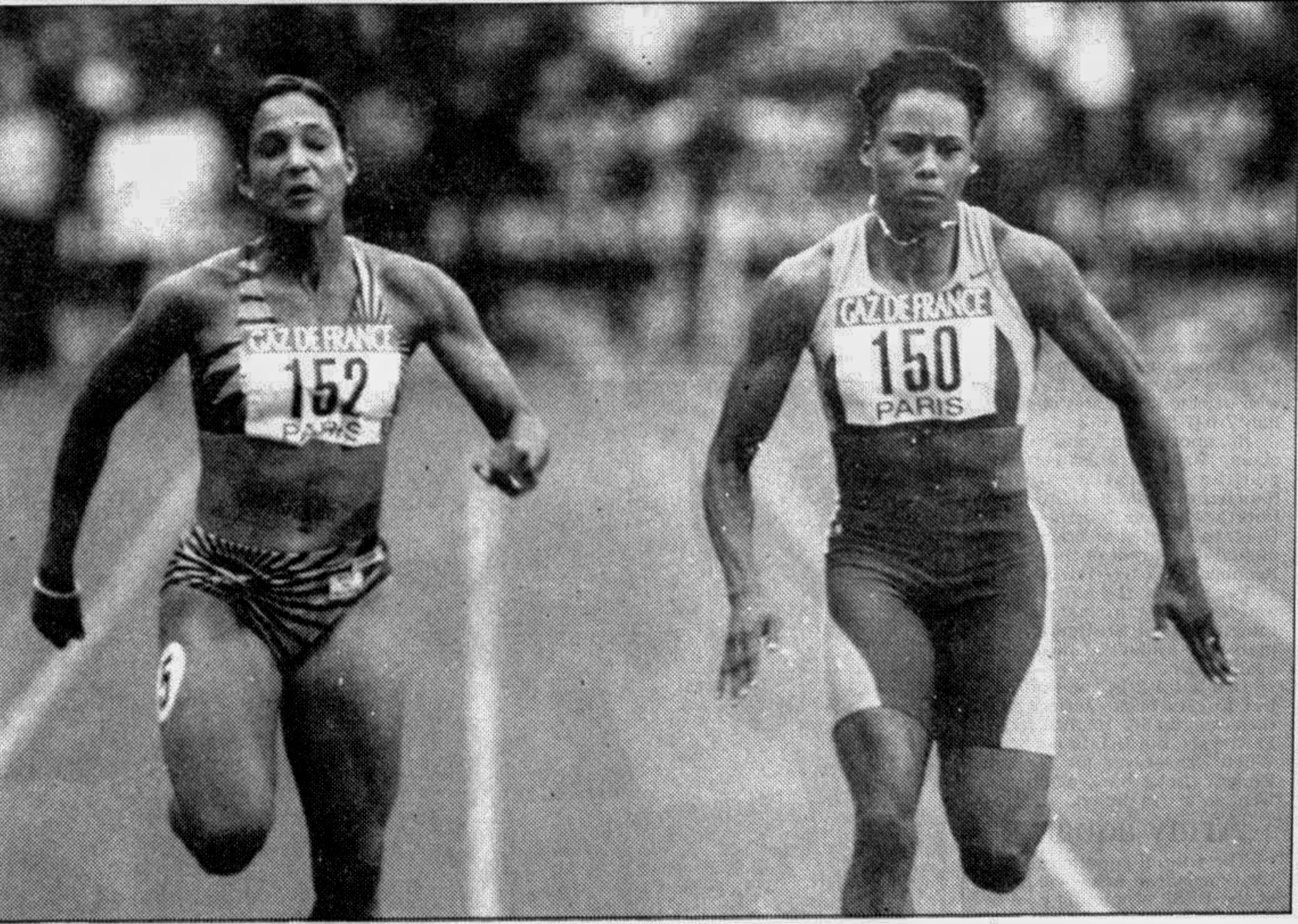
SUPERFAST LADIES: Marion Jones (R) of the USA and France's Christine Arron sprint neck to neck during the 100 metres final at the IAAF Gaz de France athletics meet in Paris on July 29. Jones won the event clocking 10.88 sec.

Gabriela Szabo of Romania opened the meeting by clocking the best time of the season in the 3,000m and the eighth fastest in history with 8:24.31.