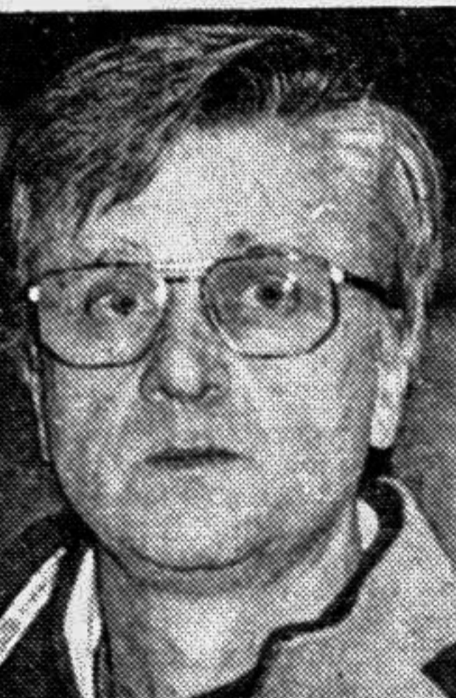
Aime Jacquet (France's World Cup winning coach)