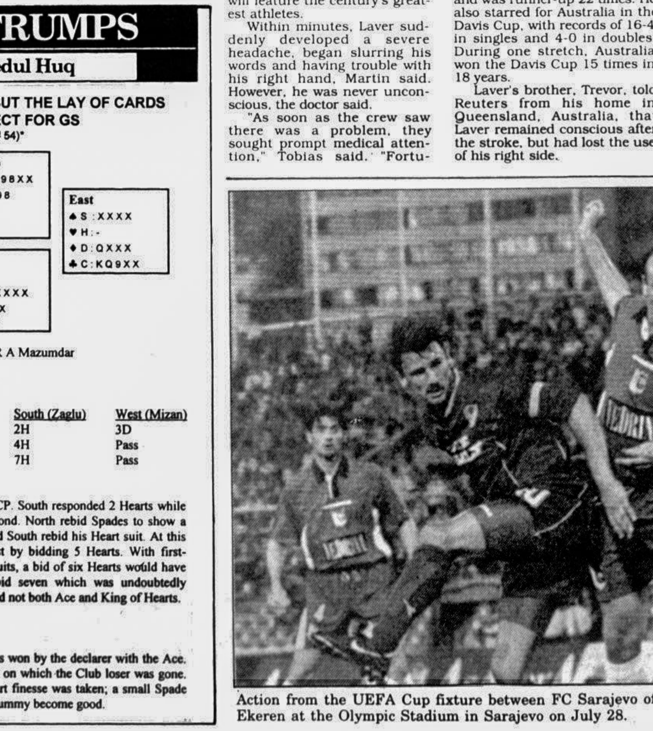
Action from the UEFA Cup fixture between FC Sarajevo of Bosnia and Belgium's Germinal Ekeren at the Olympic Stadium in Sarajevo on July 28.

Several family members waiting to visit Laver refused comment earlier, referring all questions to the hospital. Laver, an Australian who lives in Newport Beach, California, is the only tennis player to win two Grand Slams — as an amateur in 1962 and as a professional seven years later. The doctor said Laver's excellent physical condition improves his "potential for recovery."