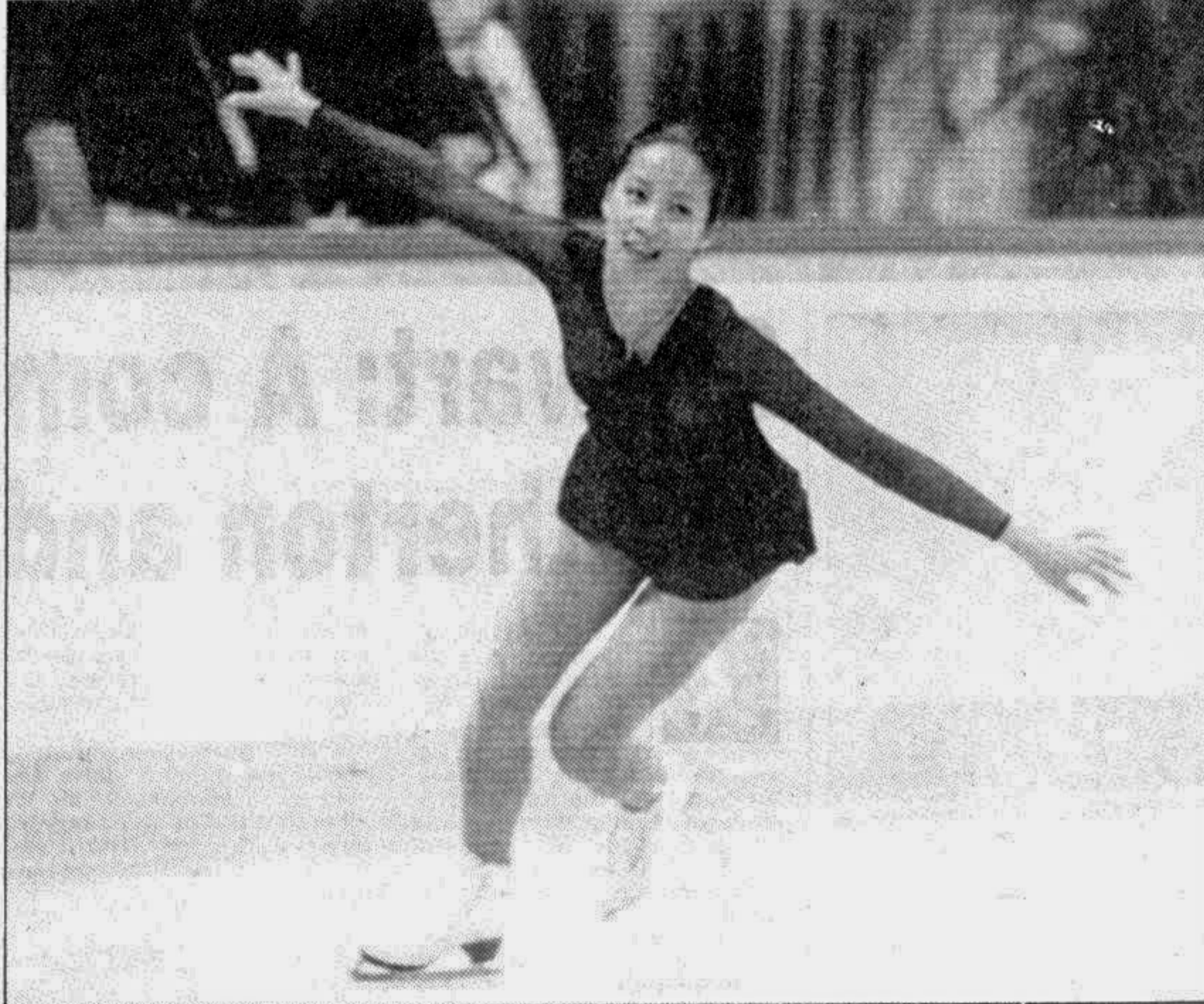
Michelle Kwan of the USA trains at the Nassau County Coliseum in Uniondale on July 28 ahead of the Goodwill Games skating competition which started yesterday.

West led the Jack of Clubs which was won by the declarer with the Ace. Next he played the Ace of Diamonds on which the Club loser was gone. At the third trick, the successful Heart finesse was taken; a small Spade was ruffed in the closed hand when dummy became good.