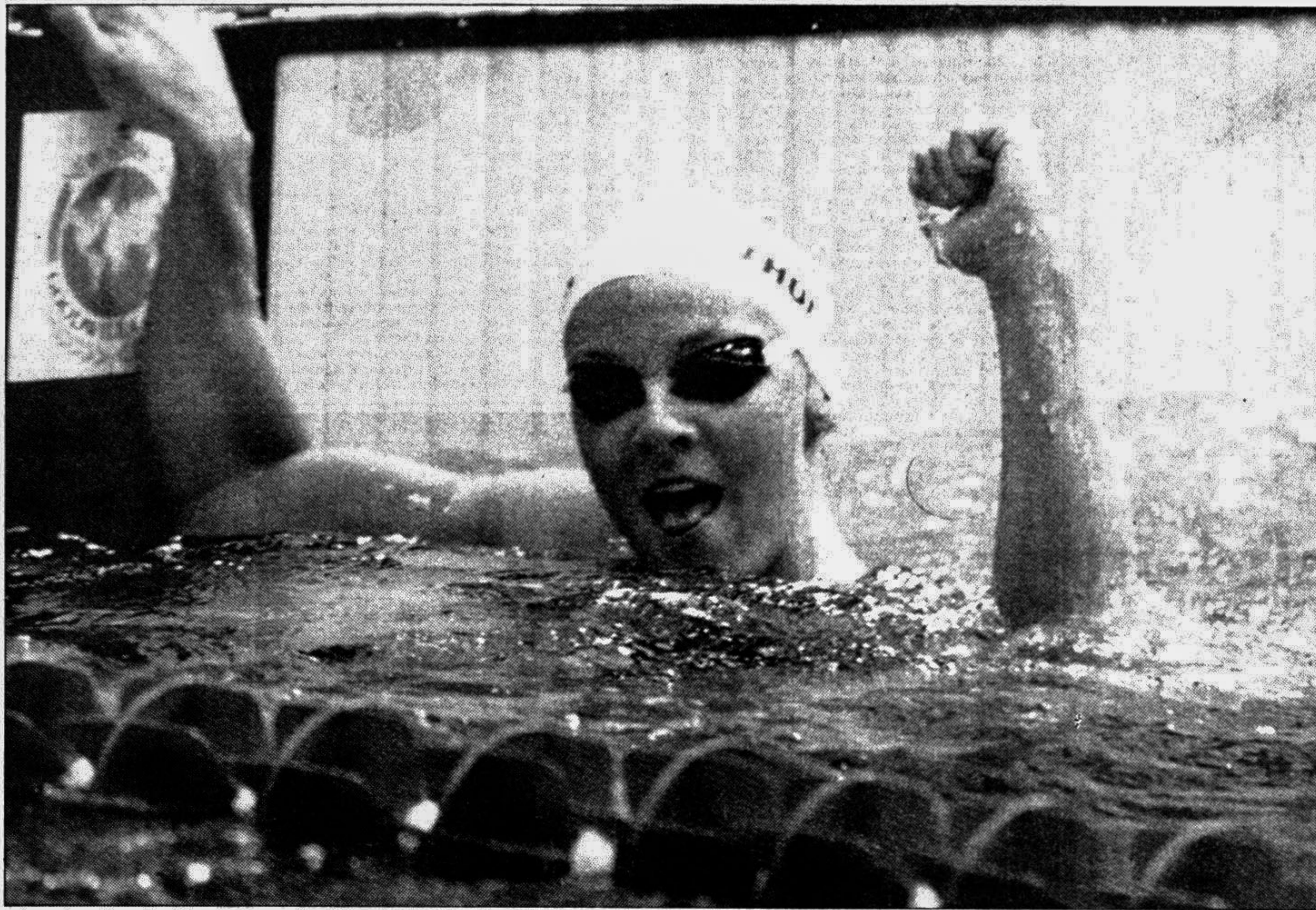
American Jennifer Thompson exults after winning the Goodwill Games 50-metre gold at Uniondale on July 28. Thompson clocked 25.77 sec.

He added that the four players playing in the English county championships have also been included in the 18-member tentative side along with two wicketkeepers, adding that only one of the two will go to Canada.