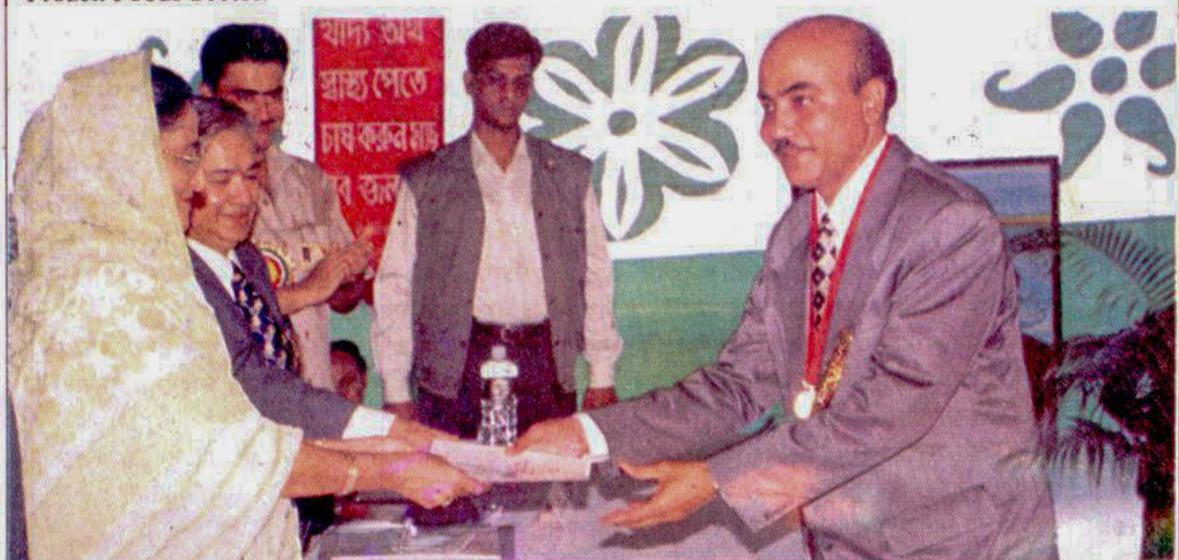
On behalf of BFFEA, President is receiving the Gold Medal from Hon'ble Prime Minister Sheikh Hasina at the inauguration of Fisheries Week 1998.