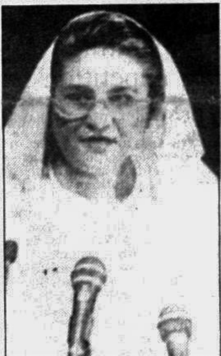
Sheikh Hasina addressing the 10th SAARC summit yesterday.

"The recent nuclear tests in the region was a development that could have been avoided," Prime Minister Hasina said in her speech at the opening session attended by the heads of state and government of See Page 12 Col 7