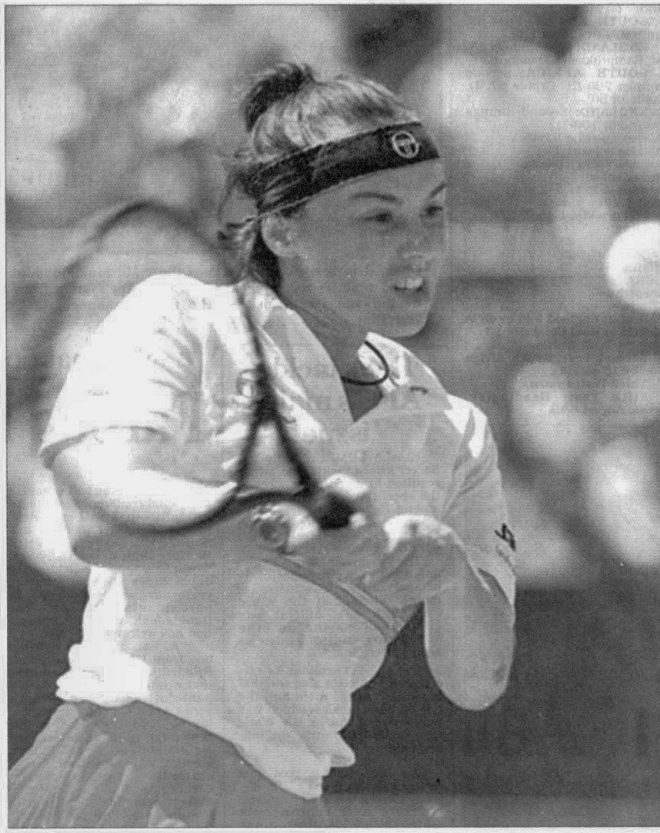
World No 1 Martina Hingis of Switzerland executing a backhand during her Federation Cup semifinal encounter with France's Amelie Moresmo at Sion on July 26. Hingis won 7-5 (6-7), 6-4, 6-2.