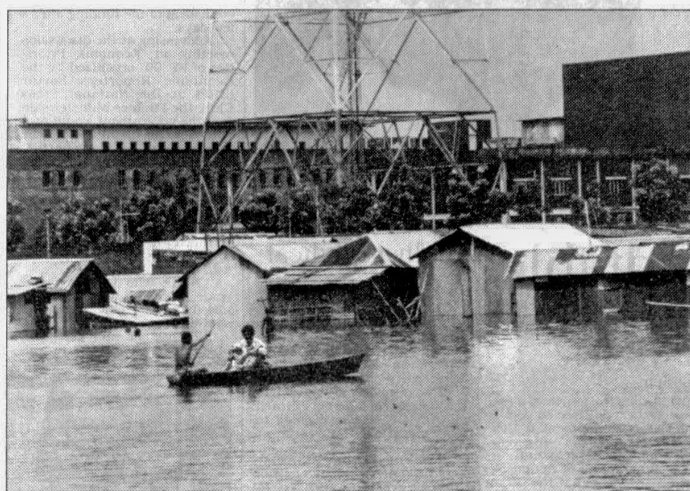
Flood waters behind the Rampura TV station in the city yesterday.

SATKHIRA, July 27: At least one person was killed and several others were injured today when a group of landless people clashed with police here over the leasing out of khas jalmahal (government-owned waterbodies).