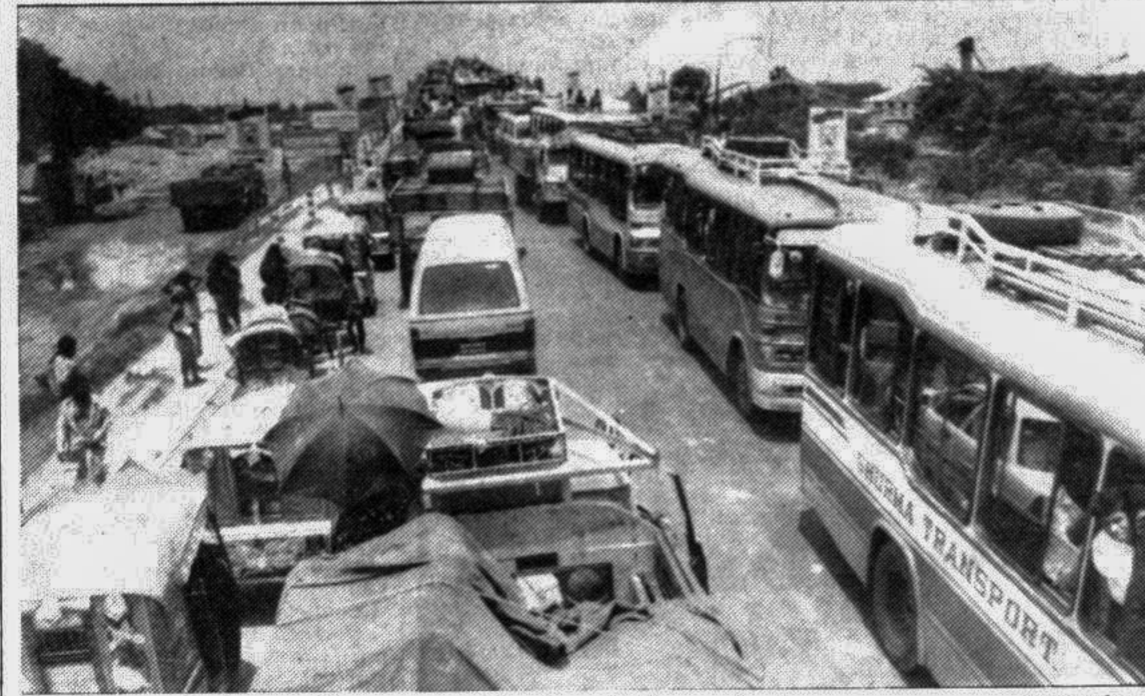
Vehicles caught in a traffic jam near Kanchpur bridge yesterday.

In a statement, they demanded exemplary punishment to the persons responsible for the death of Rubel.