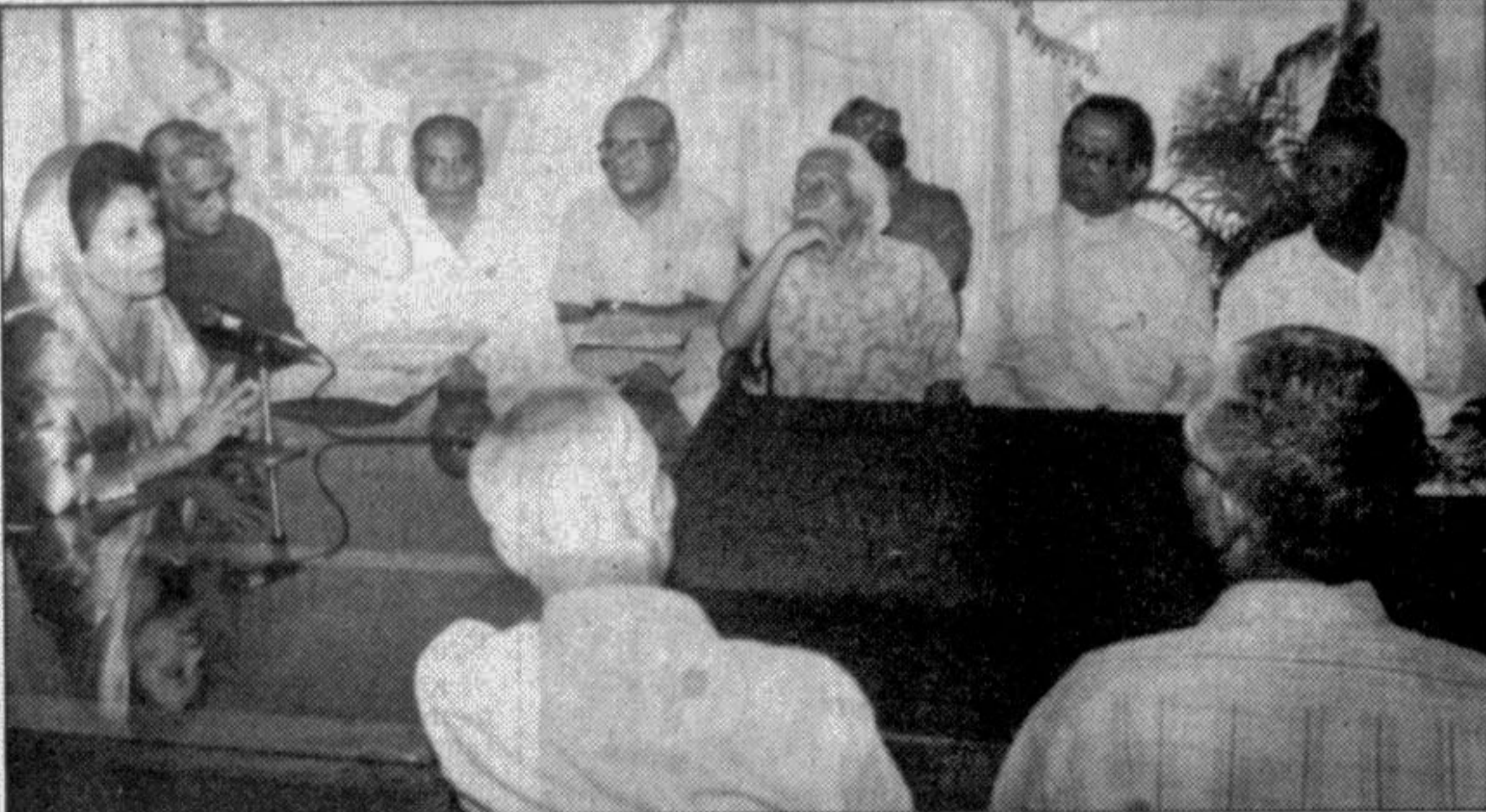
Leader of the Opposition in Parliament and BNP Chairperson Begum Khaleda Zia exchanging views with the editors and senior journalists of national dailies at her Minto Road official residence in the city yesterday.

When contacted, the officer-in-charge of Mohammadpur thana told The Daily Star last night that some local youths may be involved in the incident.