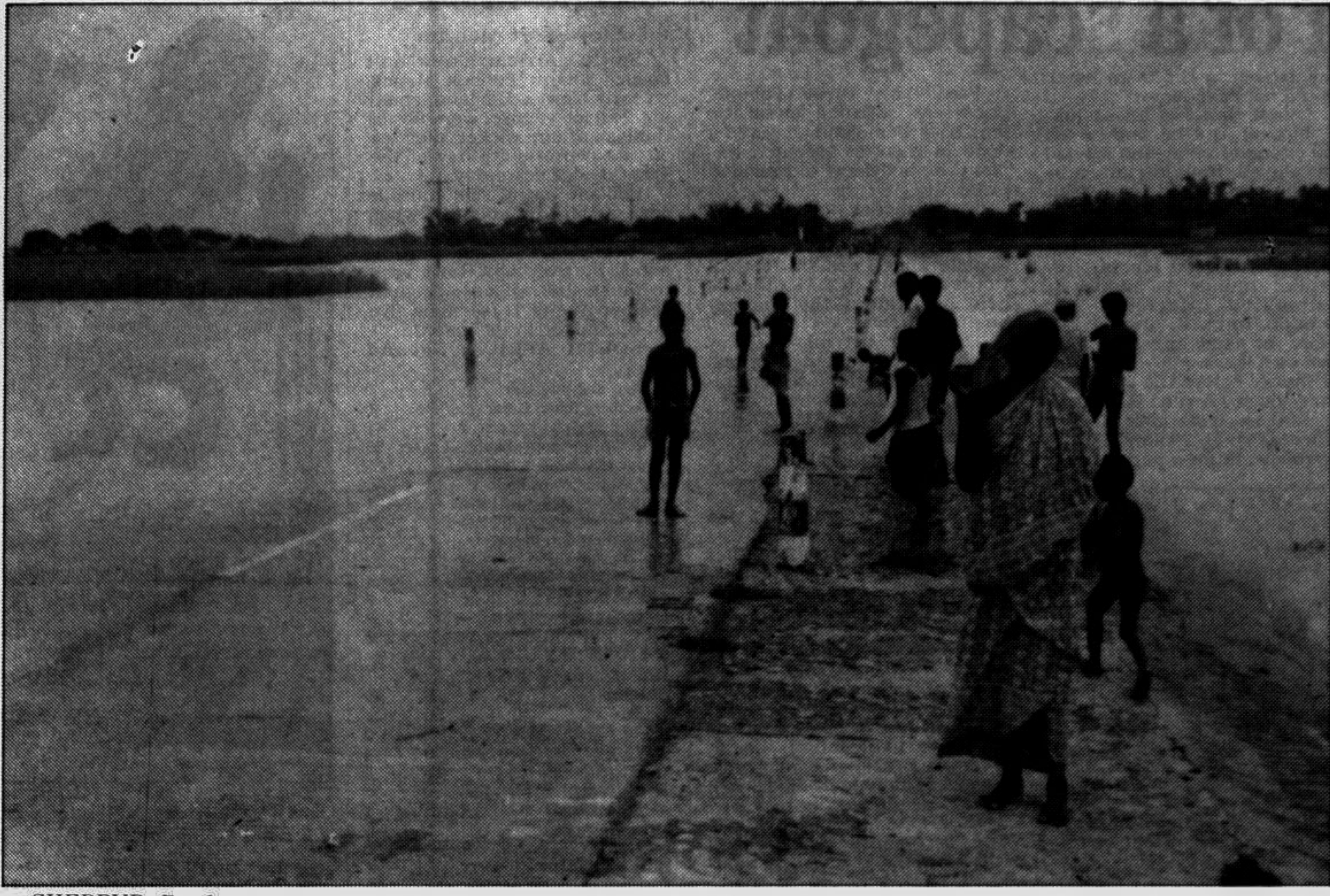
SHERPUR: Road communication has been snapped for the last few days due to inundation of Sherpur-Jamalpur road in flood waters.

JAMALPUR, July 26: The telephone exchange in Islampur thana headquarter is beset with various problems hampering the service to the people, reports UNB. Local subscribers said they are being deprived of getting phone lines properly as most of the machinery are very old. Officials said the magneto exchange, established during the Pakistan period, can only give lines to eight subscribers at a time though it has provision for 131 line service. Subscribers said they have to wait for long for getting through a line and complained that only one operator work in the exchange at a time though there is provision for two operators to work together. Local people have urged the authorities to introduce auto system at the exchange immediately.