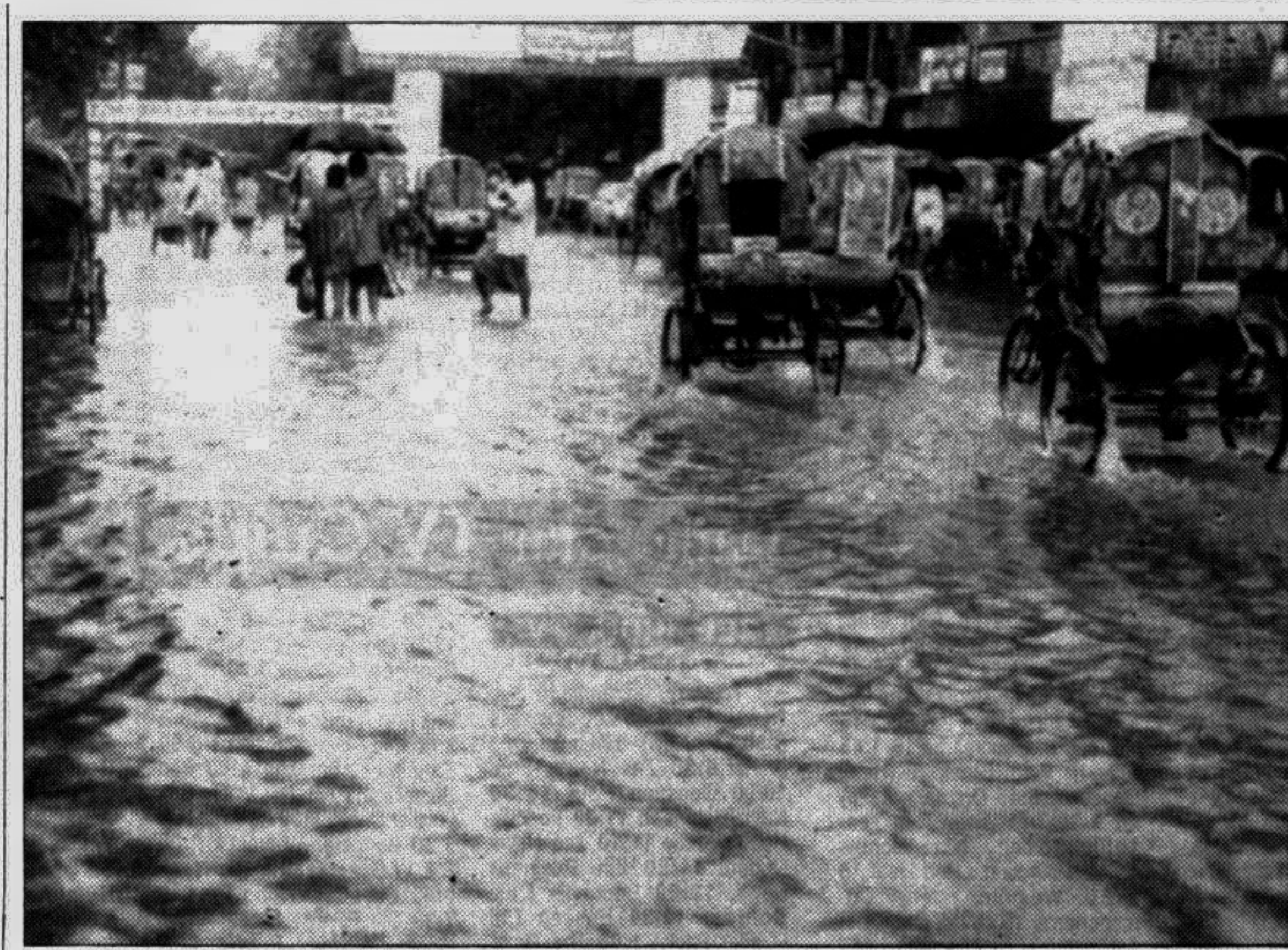
SYLHET: Heavy downpour has caused water-logging at Surma Market area in the divisional town.

MYMENSINGH, July 26: Truckers barricaded the Dhaka-Mymensingh road in Sadar thana for about eight hours since on Monday creating a severe traffic congestion on the road, reports UNB. Police said the angry truck workers put up the barricade in Jamtola area protesting police action during a dacoity on Sunday night that left a truck driver injured. Witnesses said a group of 8 to 10 dacoits blocked the road with jute bundles and looted goods and cash from two Dhaka-bound trucks at about 2 am. Patrol police rushed to the spot and hit a truck driver, Shaju, 32, with a gun, assuming him a dacoit. He was admitted to Mymensingh Medical College Hospital in a critical condition.