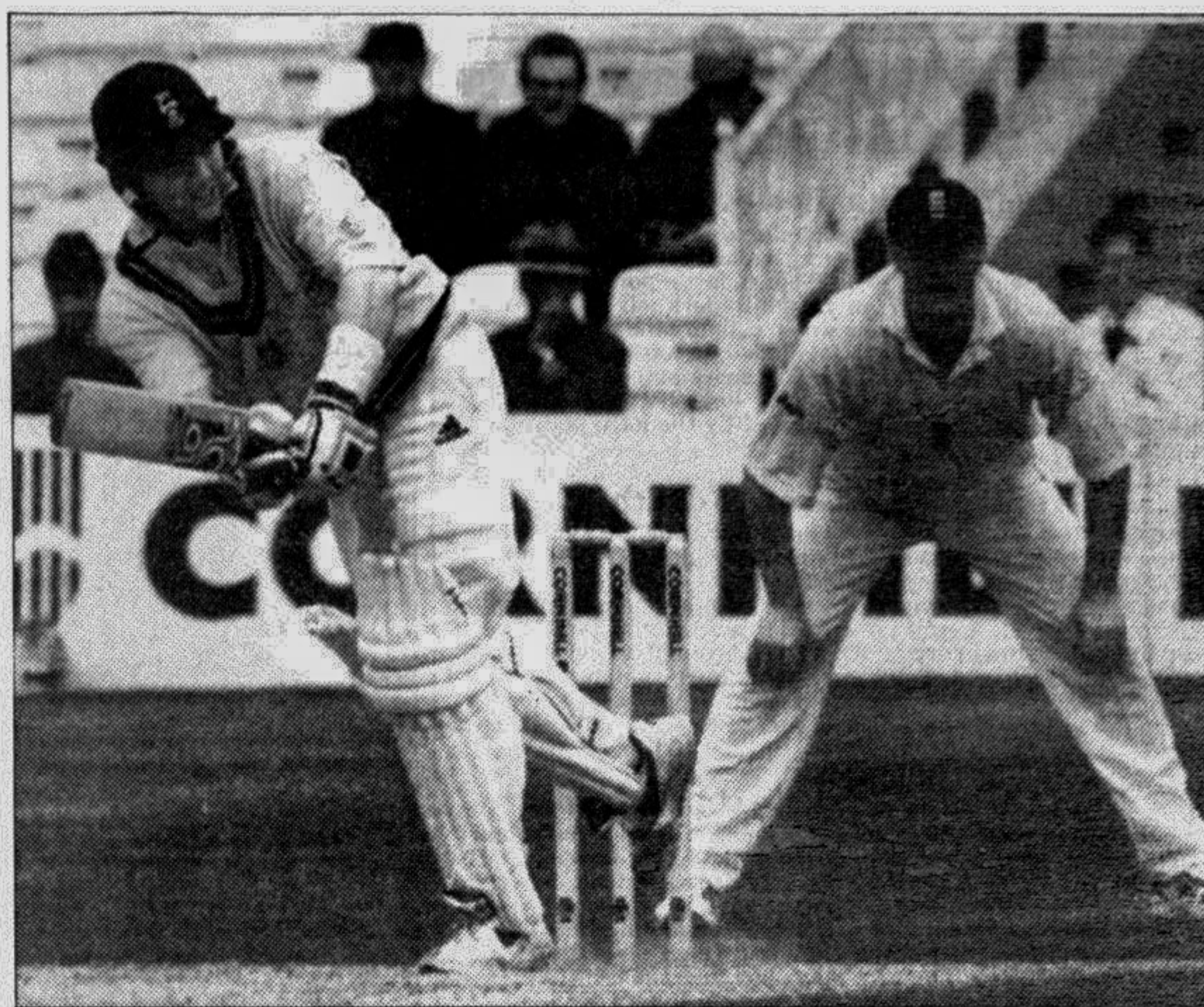
Darryl Cullinan of South Africa flicks during his innings on the penultimate day of the fourth Test against England at Trent Bridge yesterday.

Donald, though, was having none of it. "He caught them, didn't he?" he said with a smile.