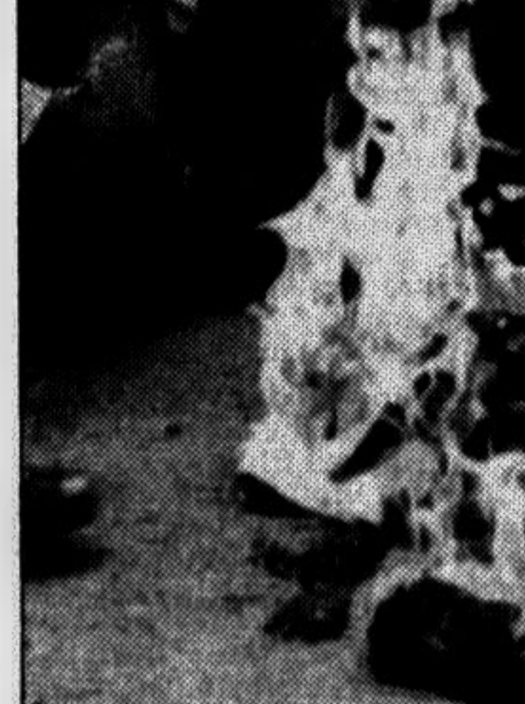
A section of students at the Dhaka University yesterday burning copies of a circular issued by the authorities raising tuition fees and other charges.

The faculty students and management of the university at a condolence meeting in the campus yesterday noon strongly condemned the "killing" in police custody.