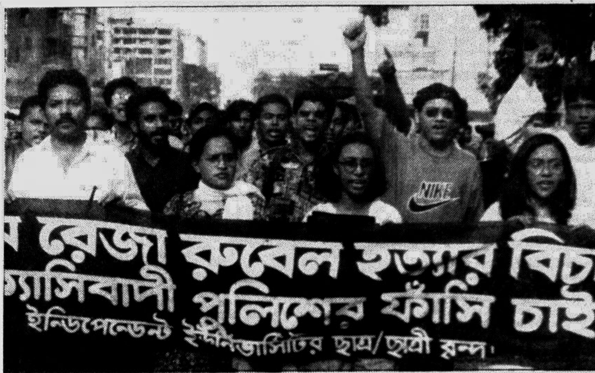
Students of the Independent University staged demonstration in the city yesterday demanding trial of the killers of Shamim Reza Rubel.

Bringing change in the existing laws in view of human rights.