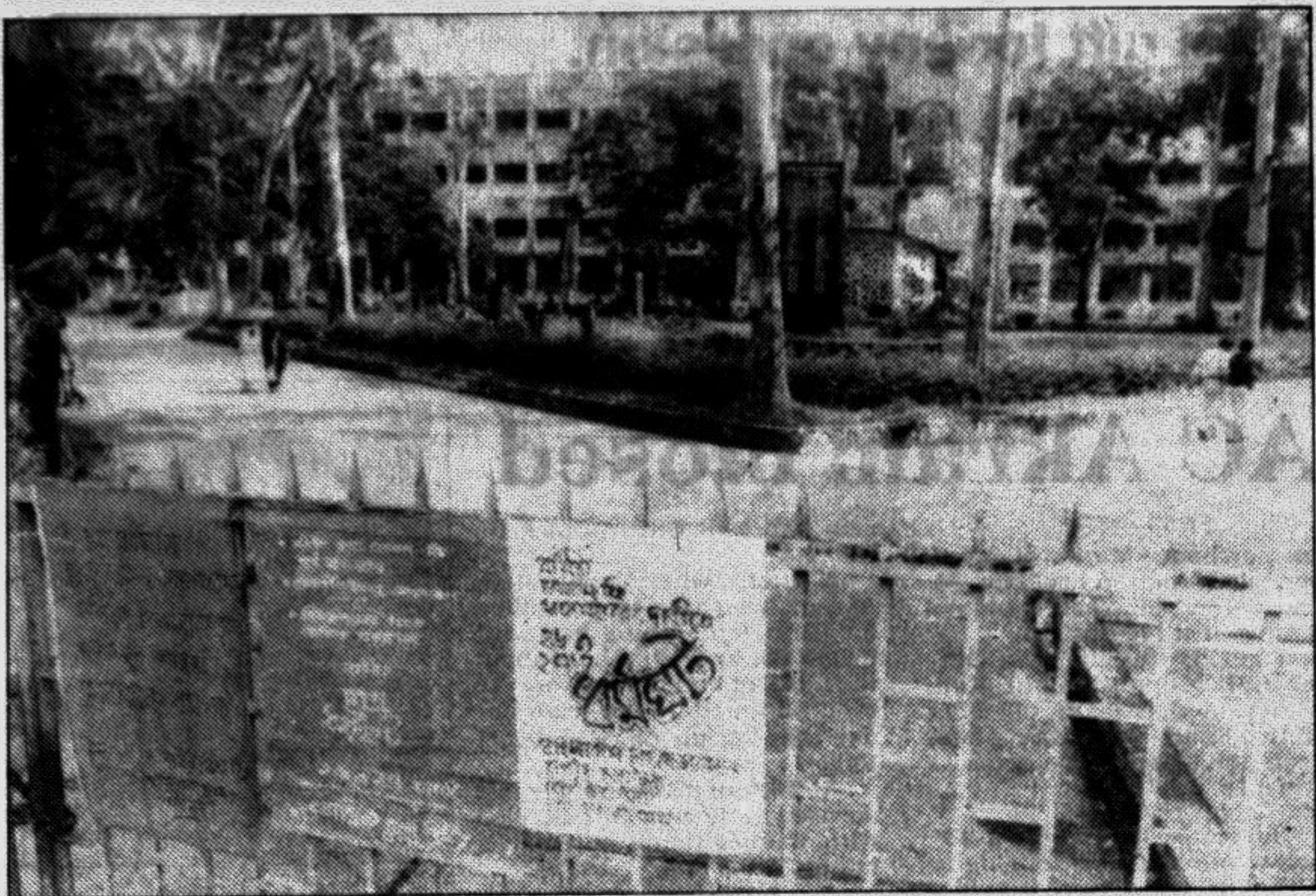
The Dhaka University campus during the strike called by four student organisations to protest tuition fee-hike. The two-day strike ends today.