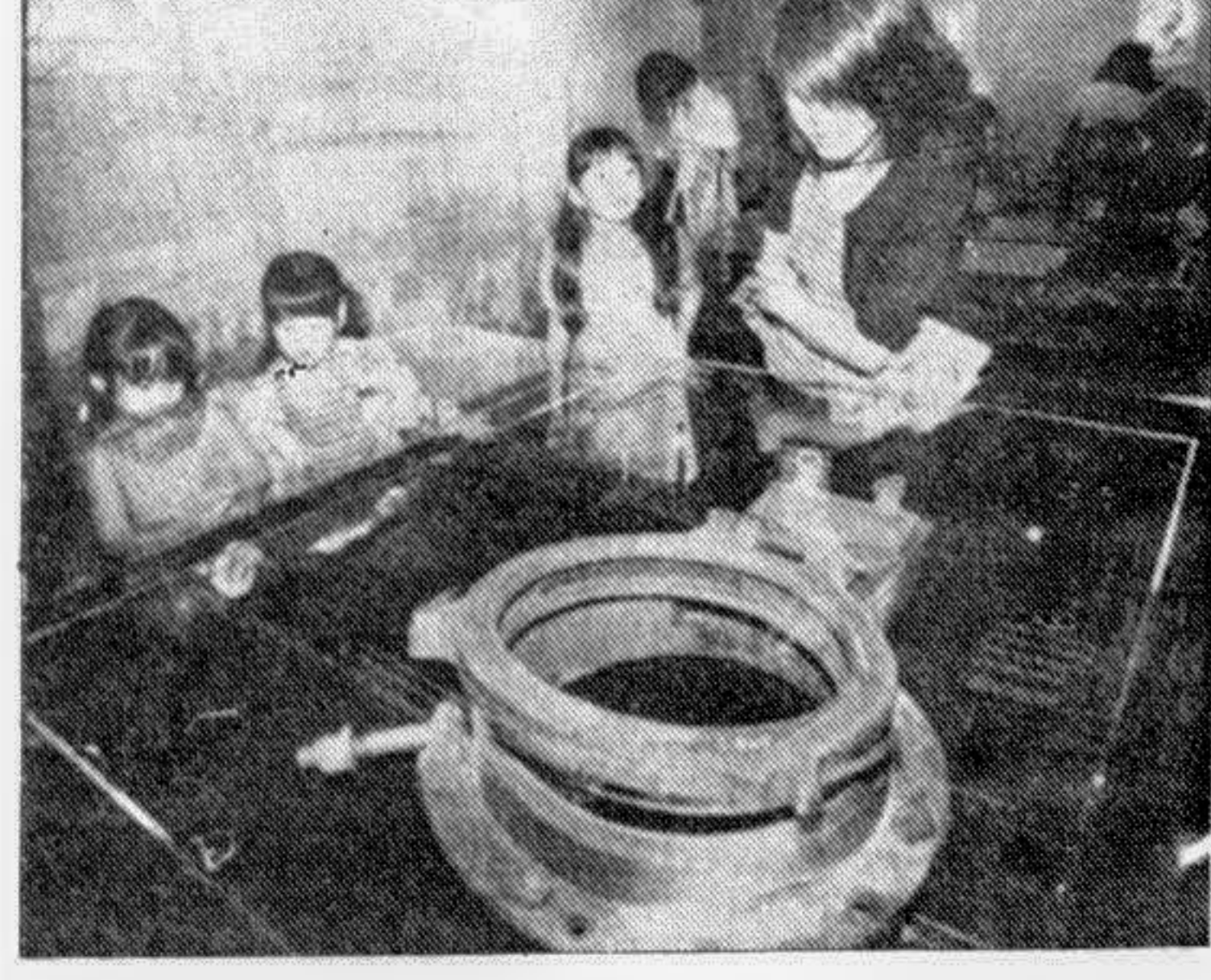
Visitors to the "Titanic Exhibition in Japan" at a Tokyo department store Friday examine a window frame and other materials which were raised from the sunken cruise ship that has been lying on the seabed of the Atlantic Ocean, off Newfoundland, since 1912. Most of the nearly 200 items displayed here until Aug 24 are being shown in public for the first time in the world.

In a sign of progress, the Indonesian government announced Friday that it would withdraw some of the 12,000 soldiers deployed in east Timor.