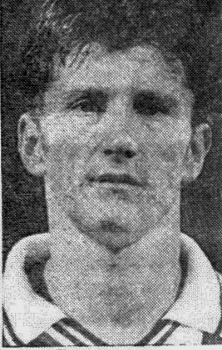
Davor Suker (Croatian superstriker) "Taking the second penalty was very tough. My heart was beating fast." After Croatia beat Romania.