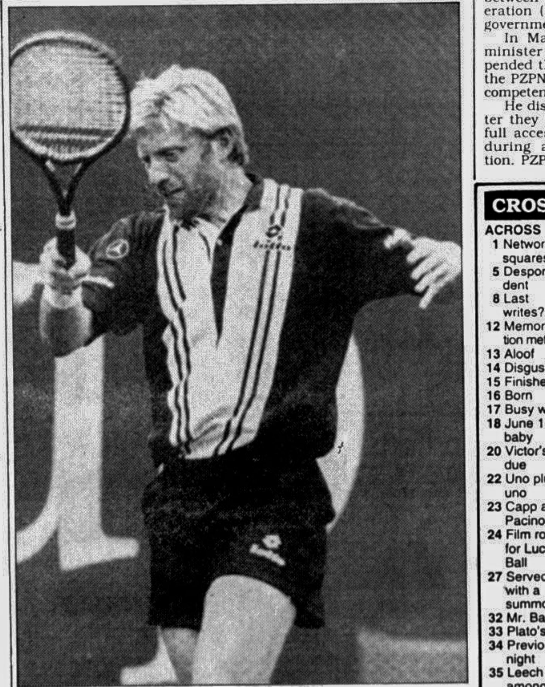
Boris Becker executes a forehand during his ATP tournament match against Spaniard Felis Mantilla at Stuttgart on July 23. Becker won 7-6, 7-5.