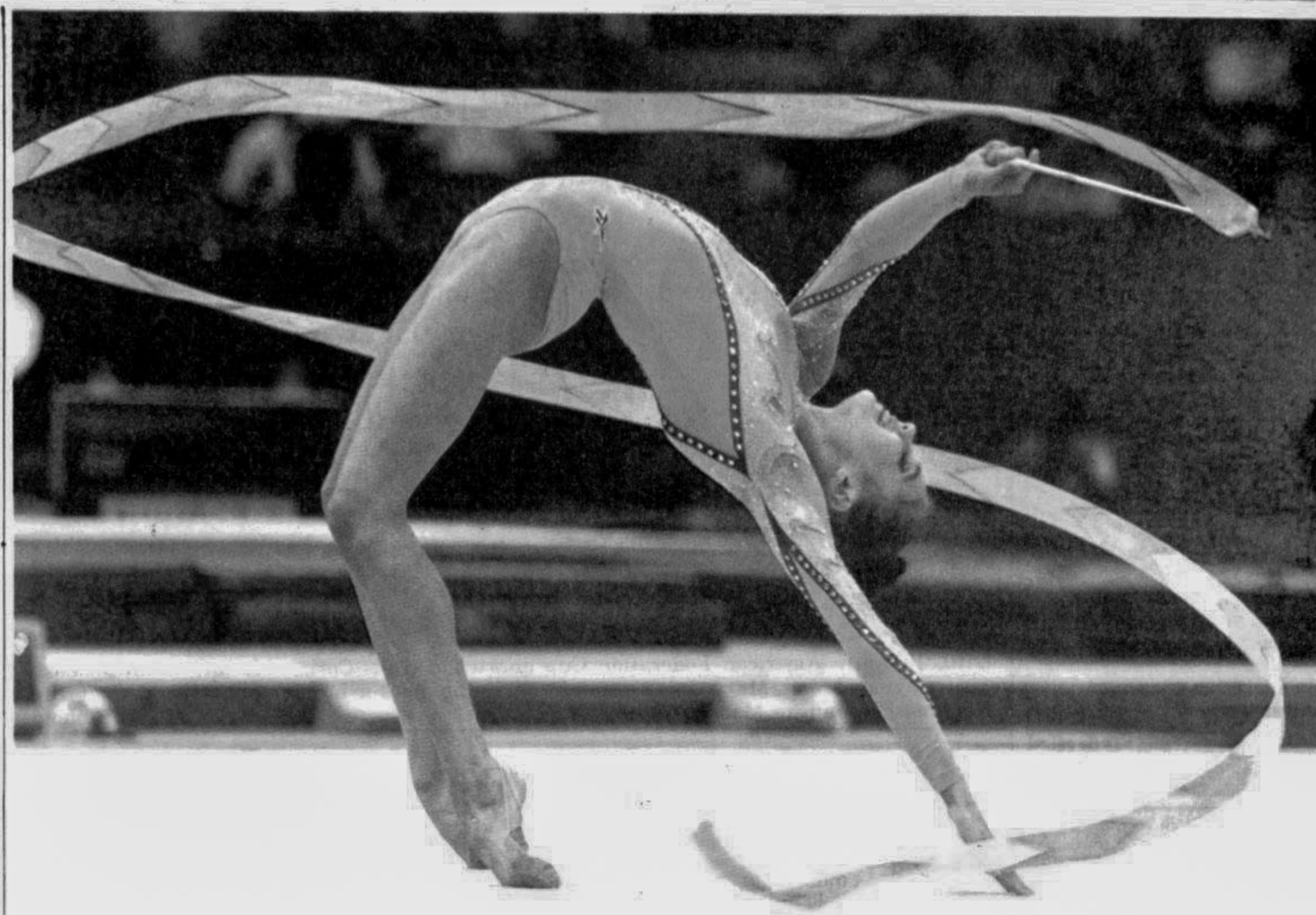
EXUDING ELEGANCE: Russia's Alaina Kabayeva showing off her mesmerising skills in rhythmic gymnastic at the Goodwill Games in New York on July 23.

(Part Two in tomorrow's Daily Star sport)