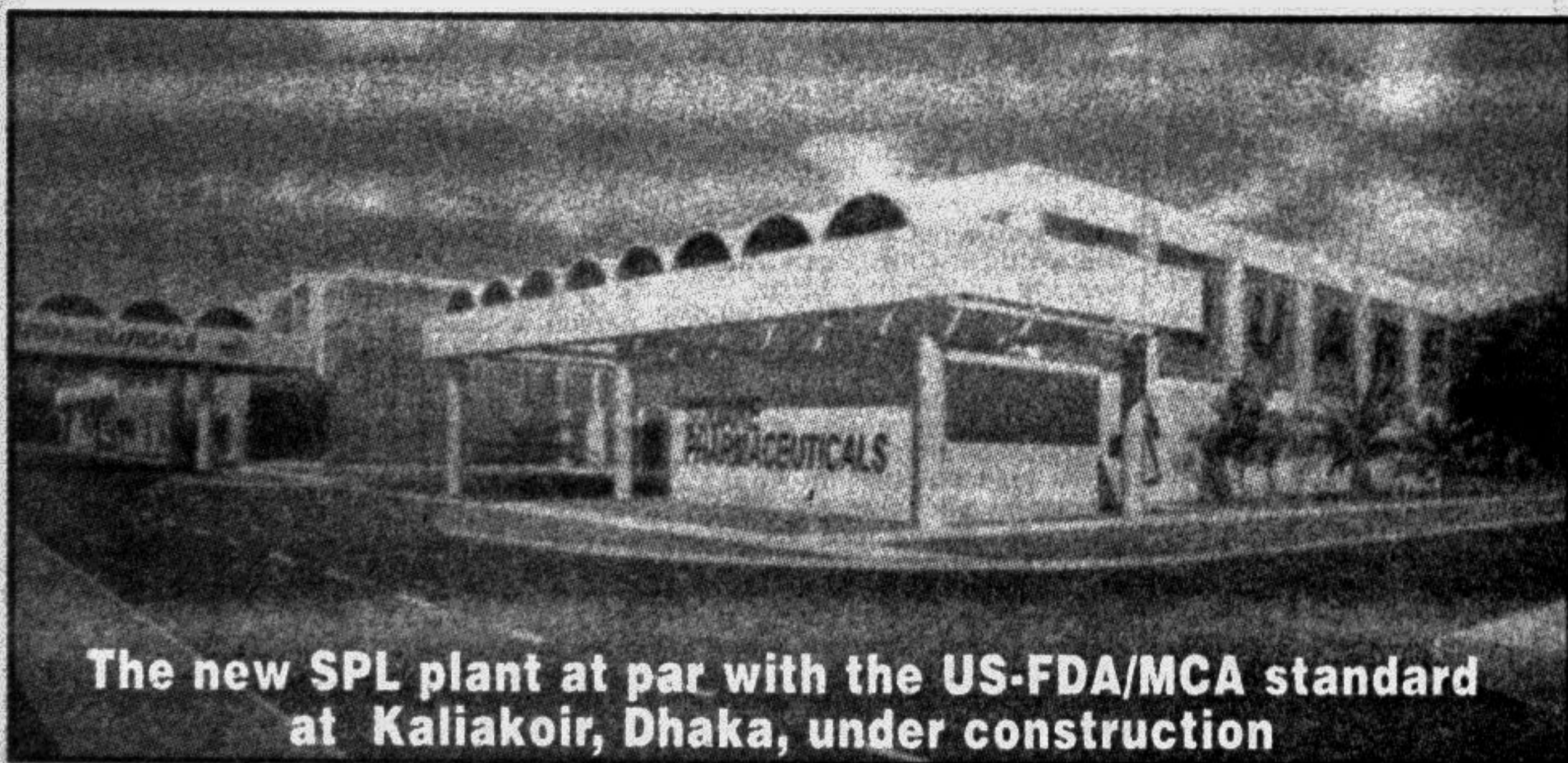
The new SPL plant at par with the US-FDA/MCA standard at Kaliakoir, Dhaka, under construction