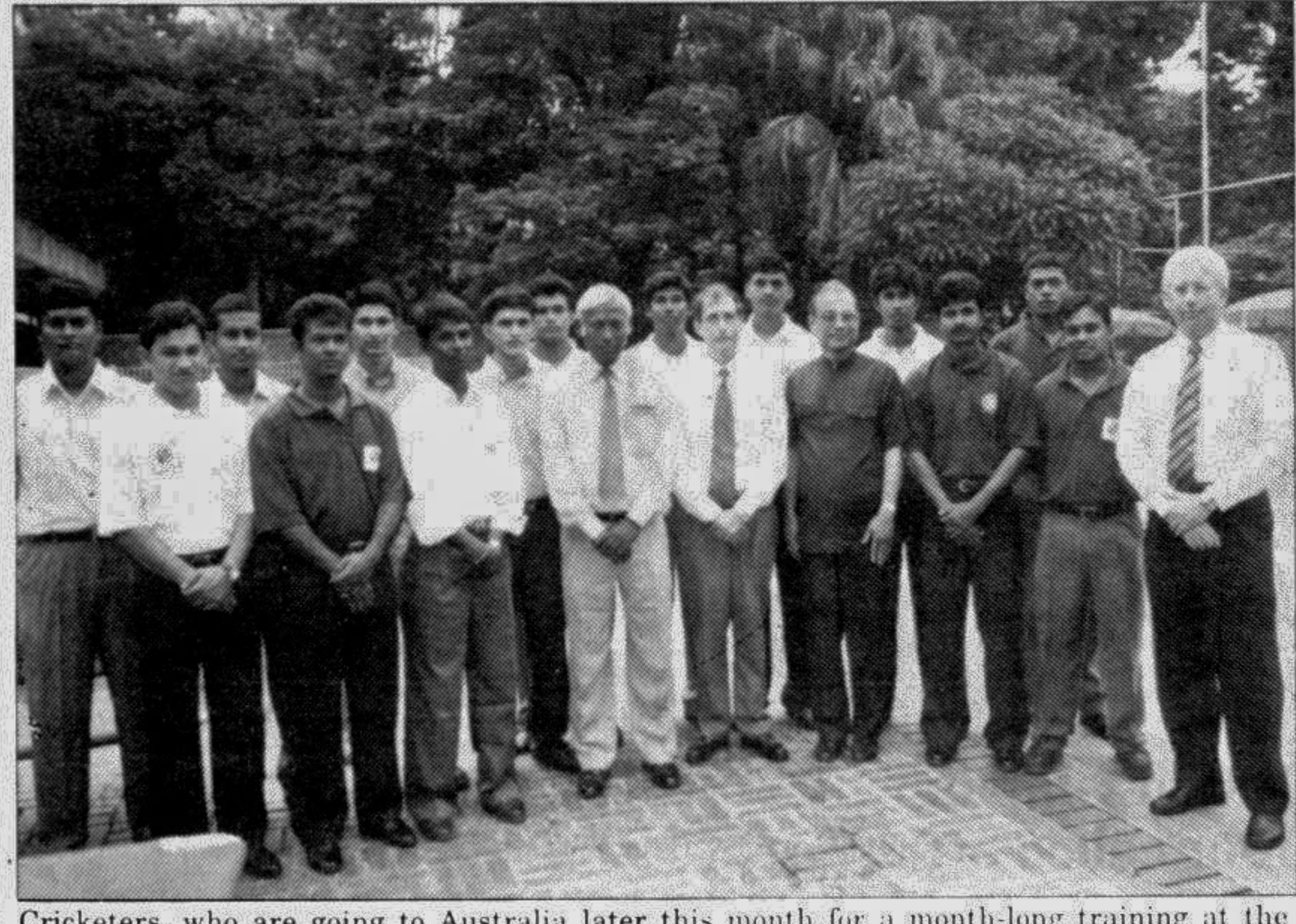
Cricketers, who are going to Australia later this month for a month-long training at the Adelaide Cricket Academy, are with the Australian High Commission officials at the commission premises during a reception yesterday.