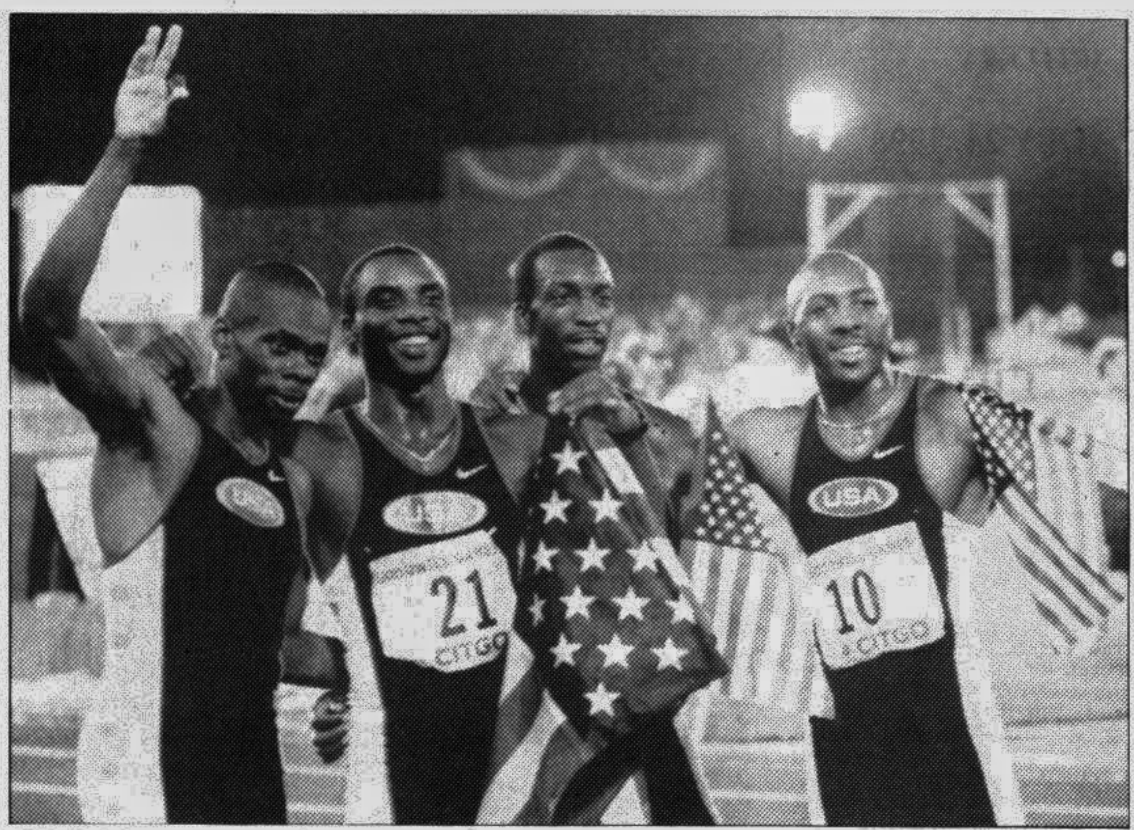
BEAT THAT! The world record setting US 4x400 metres relay quartet of (L-R) Antonio Pettigrew, Jerome Young, Michael Johnson and Tyree Washington after their triumph at the Goodwill Games in New York on July 22.