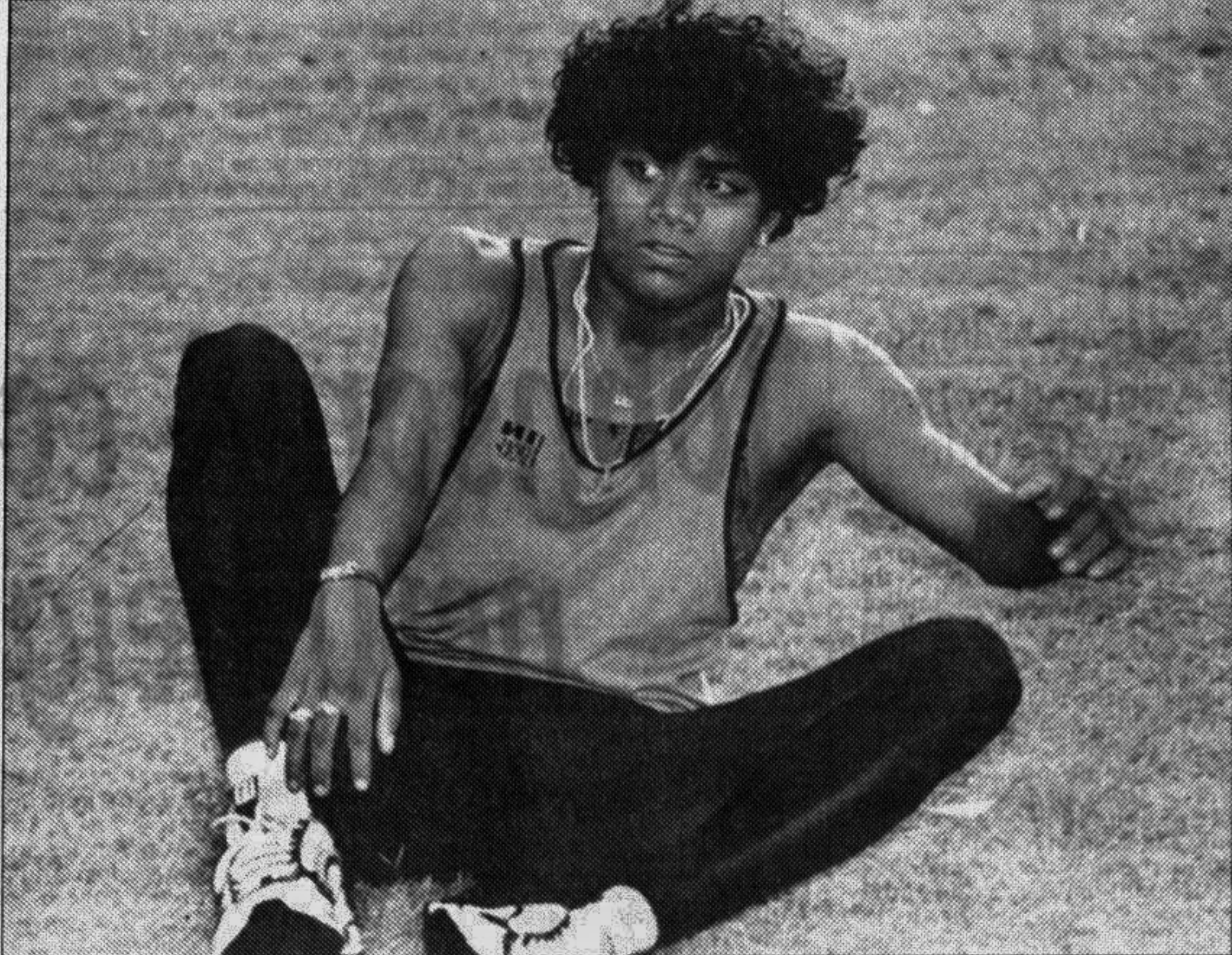
An AFP file photo of suspended Sri Lankan track starlet Susantika Jayasinghe in December 1997. It has been reported that Jayasinghe, who allegedly failed a drug test, resumed training amidst speculations that she had been cleared of the charges against her.