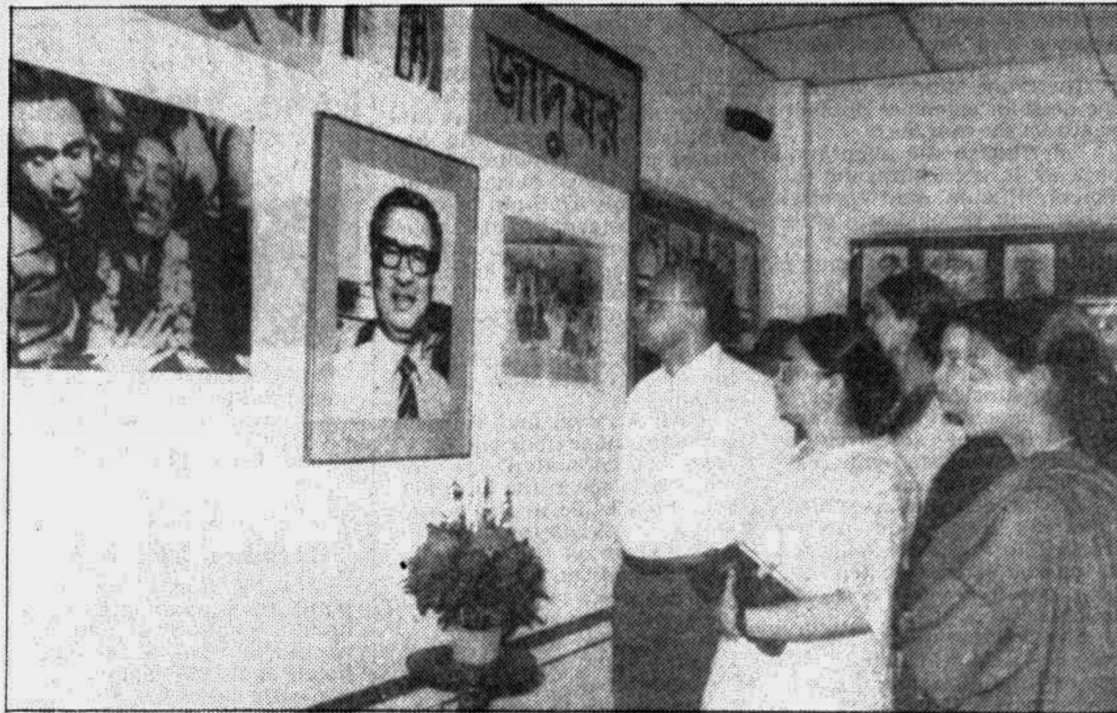
A photo exhibition on the life and contributions of late Tajuddin Ahmed, first prime minister of Bangladesh, was organised by Muktijuddha Jadughar in the city yesterday.

Later, she inaugurated the "fish exhibition" at the Krishibid Institution premises and released fish fry at the Sangsad Bhavan lake.