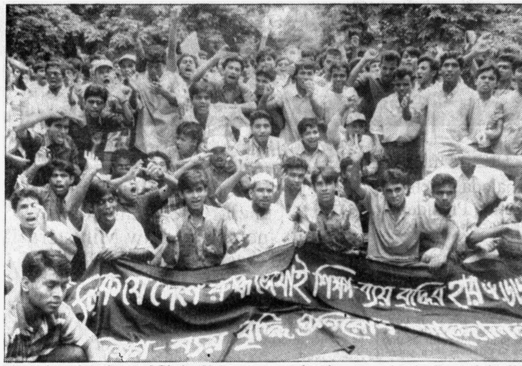
A section of students of Dhaka University staged a demonstration in front of the Vice-Chancellor's residence yesterday protesting increase in tuition fees and other charges.