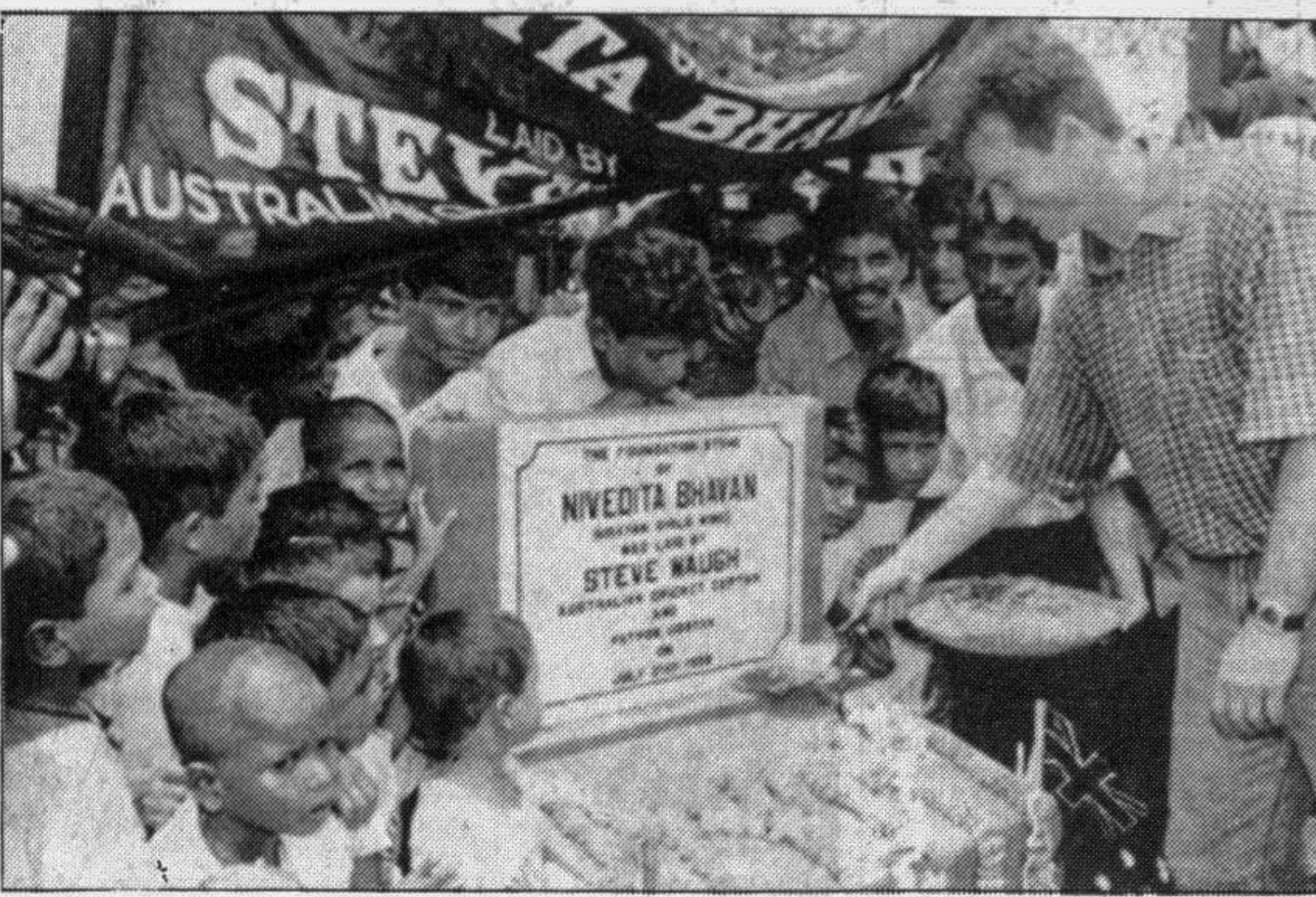
THE OTHER SIDE OF STEVE WAUGH: Australia's star batsman Steve Waugh laying the foundation stone of a home for minor girls affected by leprosy at Kathalia, Calcutta on July 21. Waugh is in India on a fund-raising mission.