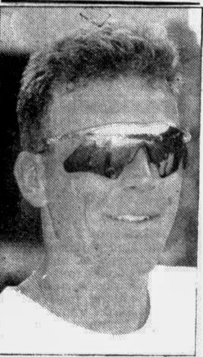
Alec Stewart (England cricket captain) "I have no magic wand. I cannot change things overnight." After being named as captain.