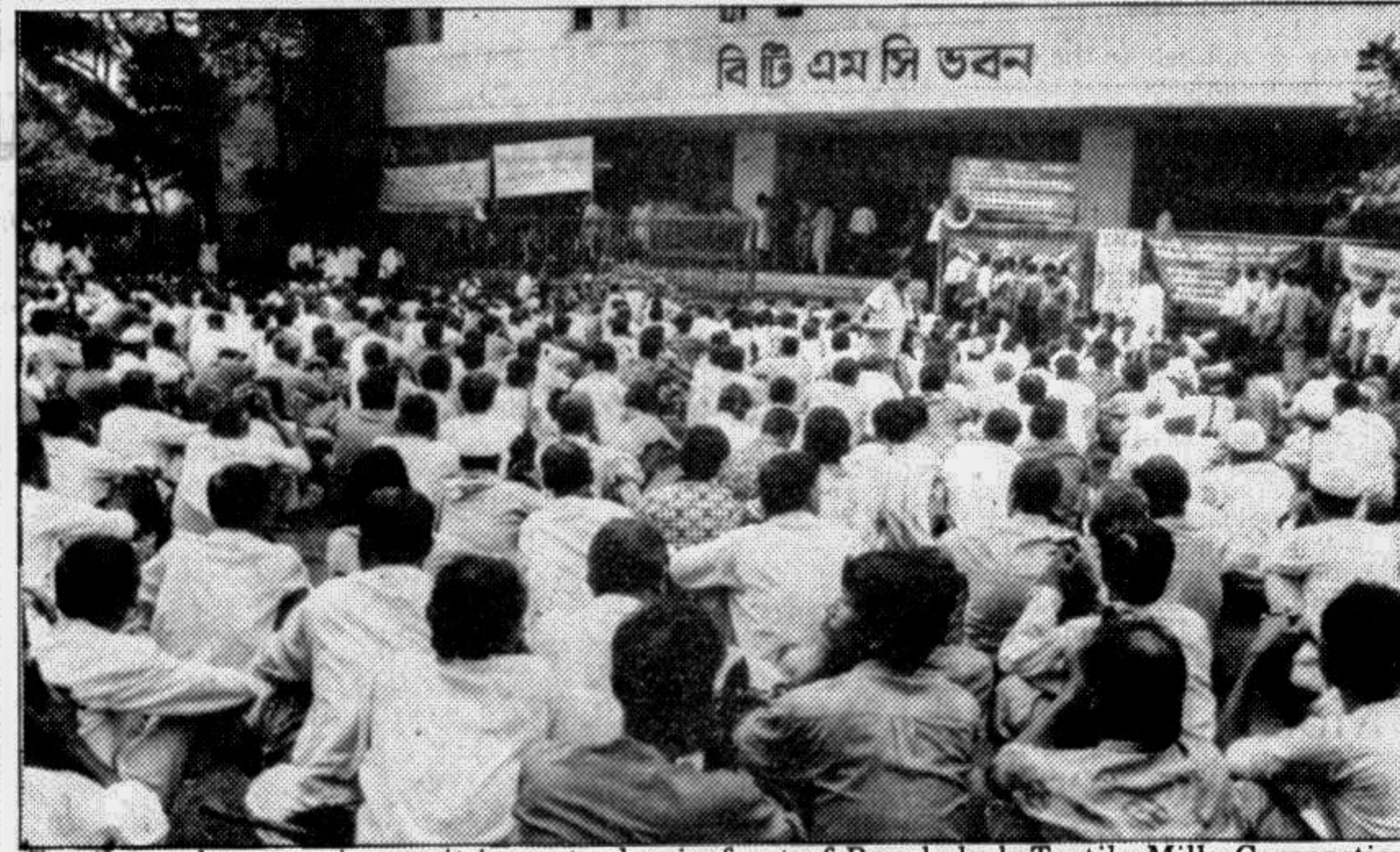
Textile workers staging a sit-in yesterday in front of Bangladesh Textile Mills Corporation Bhaban in the city to press their demands for payment of four months' arrear wages, handing over of nine mills to the workers, suspension of disinvestment programme and keeping 19 mills of BTMC running through renovation.

The Labour Secretary said one of the weakness of Bangladesh workers is that they can't speak in English. As a result, workers from the Philippines and Sri Lanka are doing better than the Bangladeshi workers in terms of wage rate. He said steps would be taken so that trained and skilled manpower could be exported.